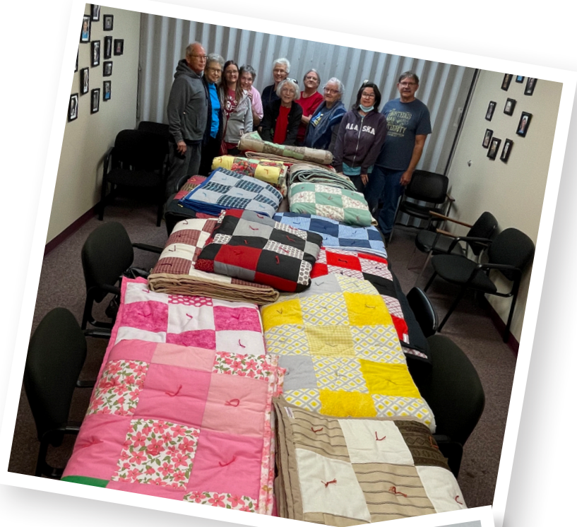
PHOTO CAPTIONS: (Top) These lovely quilts are created and donated by different churches throughout the year and then are given to our kids as they graduate from Hope Harbor. (Middle) Each year you help kids find hope in their future. (Bottom) Throughout the year, different church groups come and fix dinner for our residents. They also stay and play games with them and get to know them better.

Make plans to visit for lunch on a Wednesday during school and hang around for chapel or even be the guest speaker.