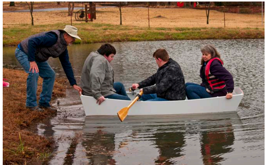
In 2019, the Spindrift Sailing Club taught a class on boat building. They worked with the kids to build a wooden row boat using only hand tools. They then took the kids out on the boat for its maiden voyage!

T hink back on your childhood for a moment. Who supported you and your dreams for your future? Who made you feel like you could accomplish goals you set out to do? A teacher perhaps or a coach? Your parents or grandparents? How did it feel when you spent time with them and learned from them? Did they mold you into who you are today?