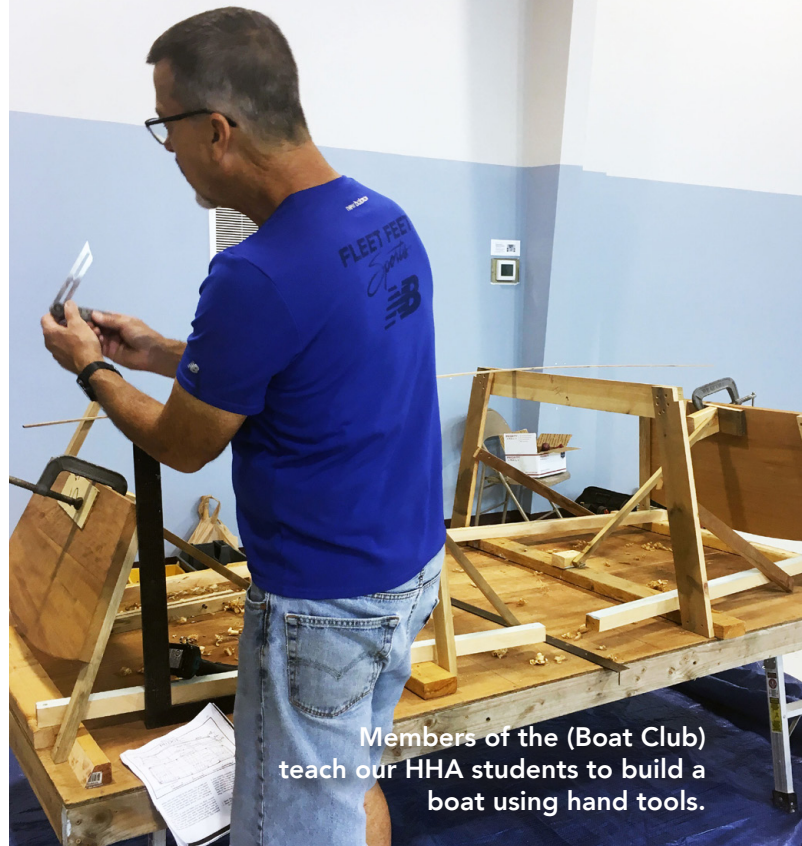
Members of the (Boat Club) teach our HHA students to build a boat using hand tools.

We are about to complete the construction of a new cottage that will add six additional placement opportunities on campus. With a growing number of families in need of help, it is important that Hope Harbor continues to expand to meet this need. We have a large campus and room for lots of expansion and a unique program that is very effective with a high rate of success. We are excited to see what our future holds.