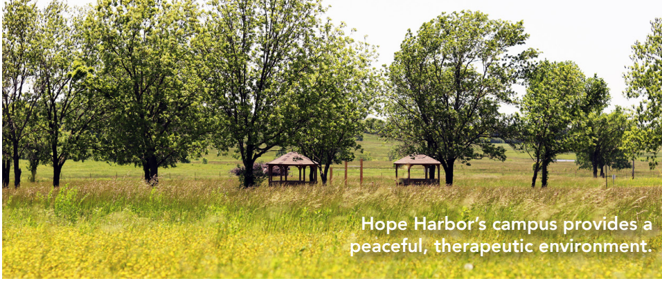
Hope Harbor's campus provides a peaceful, therapeutic environment.