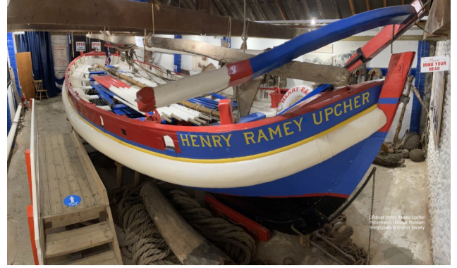
Henry Ramey Upcher Registered Historic Vessel 2481