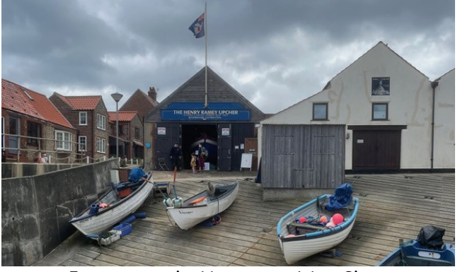
Entrance to the Museum on West Slope

A wealth of information on the earlier lifeboat the Augusta, built in 1838, is also in the museum.