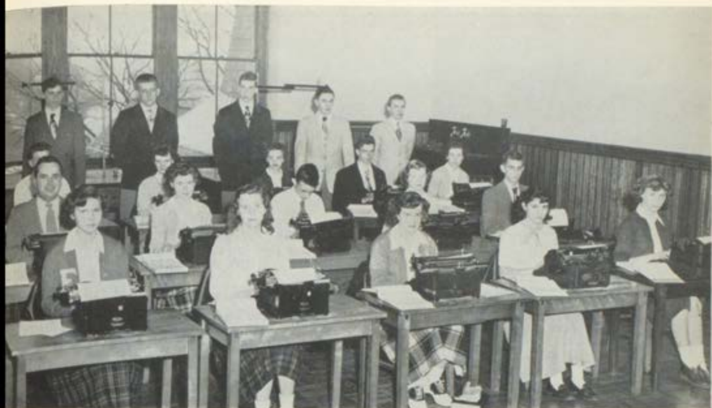
Future Secretaries of America