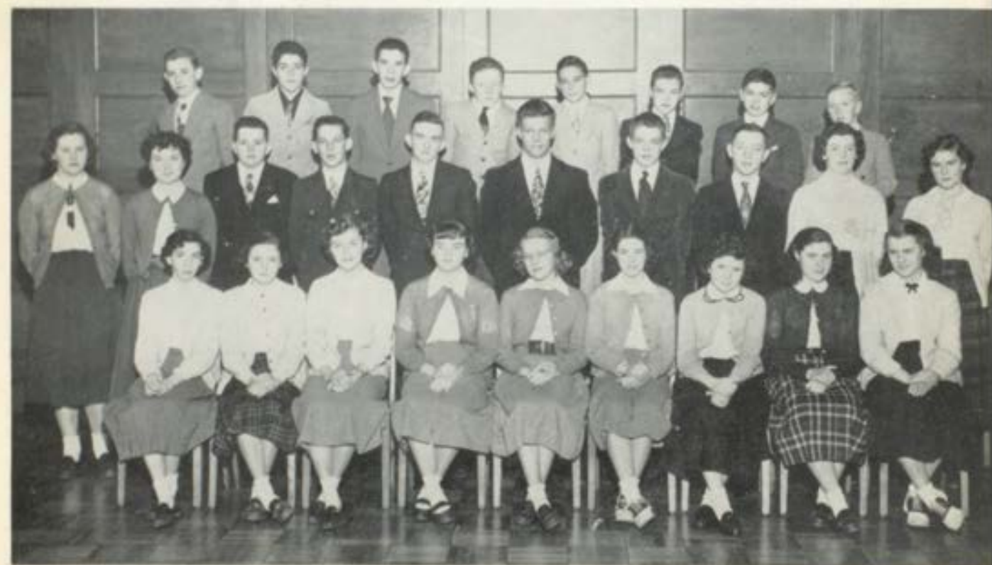
Freshmen — Class of 1955