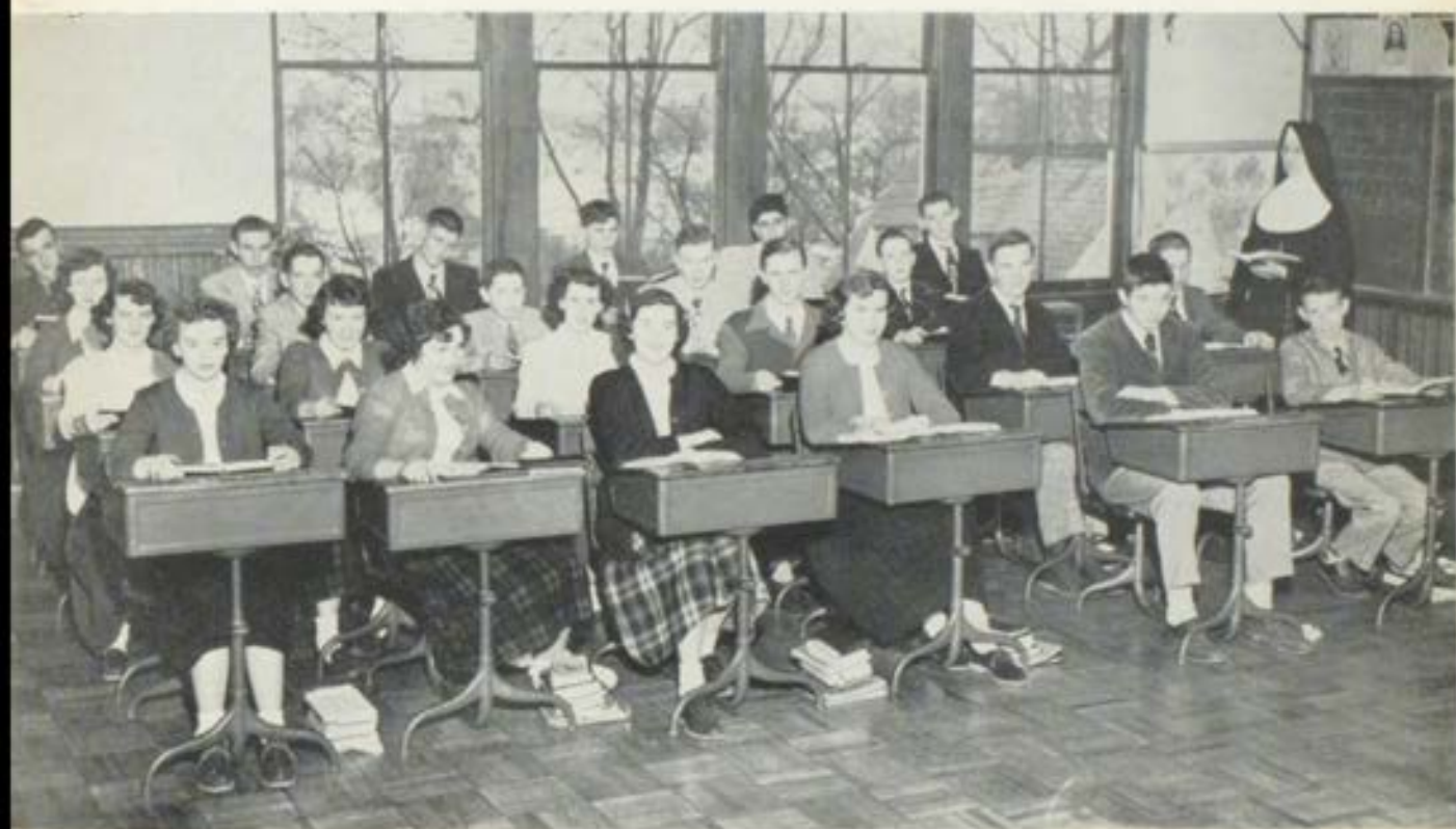
Veni! Vidi! Vici!