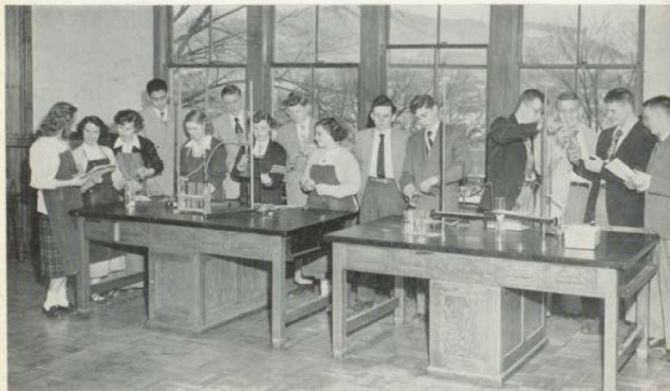
Producing an "S. M. A." Bomb