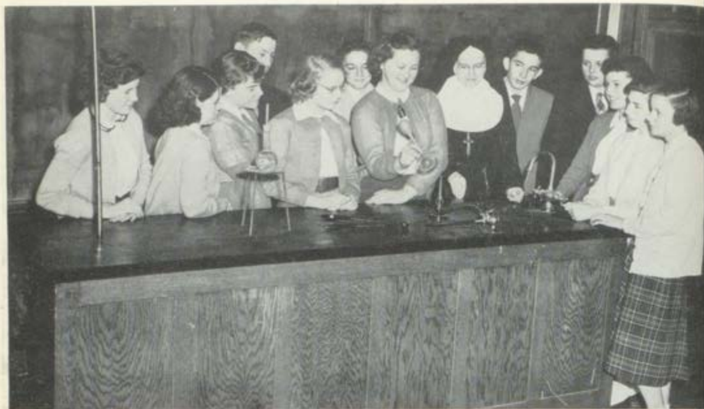
Other Einsteins in the Making