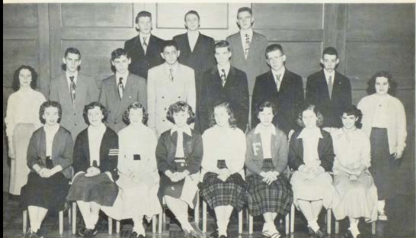
Juniors — Class of 1953