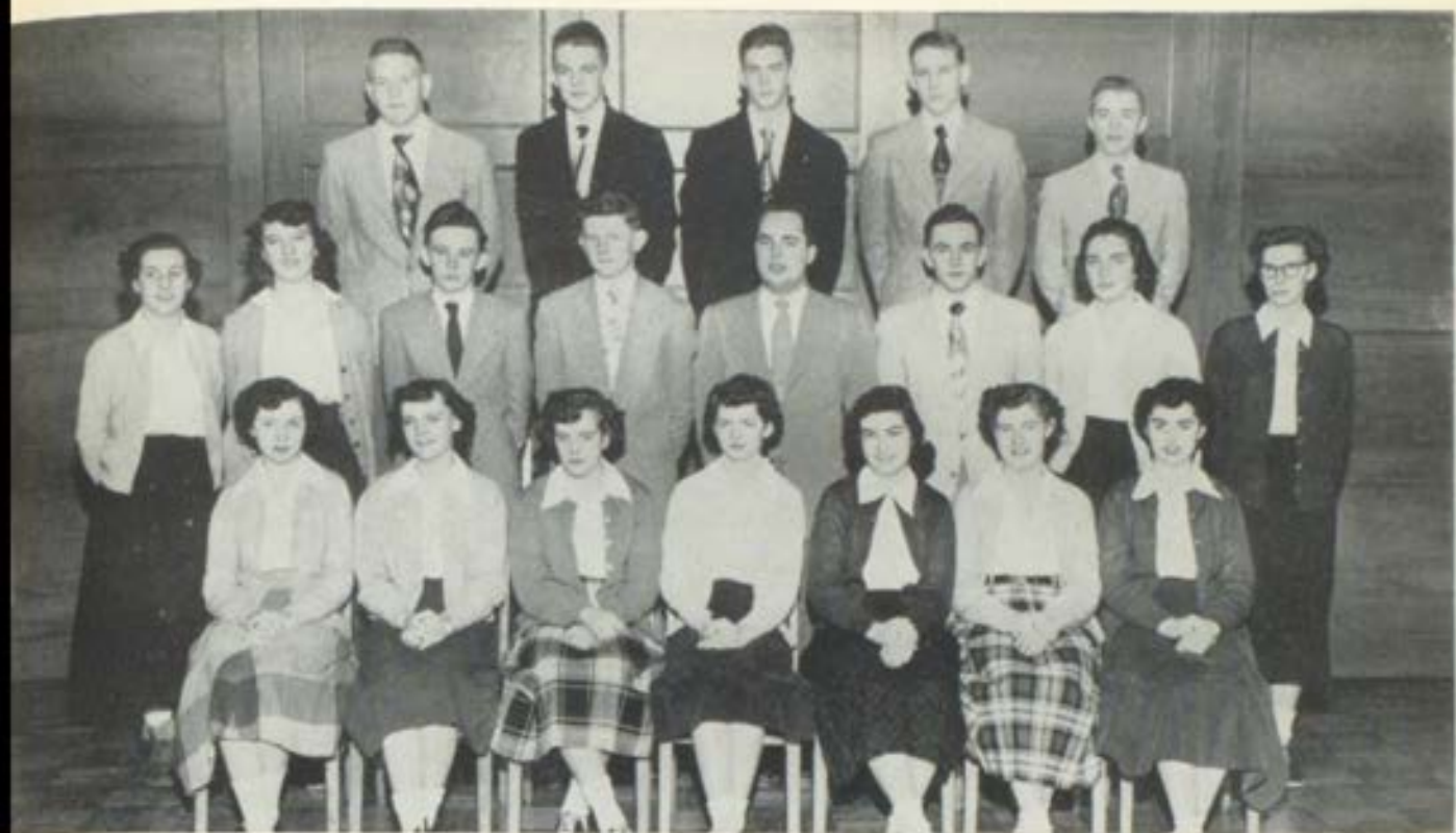
Seniors — Class of 1952