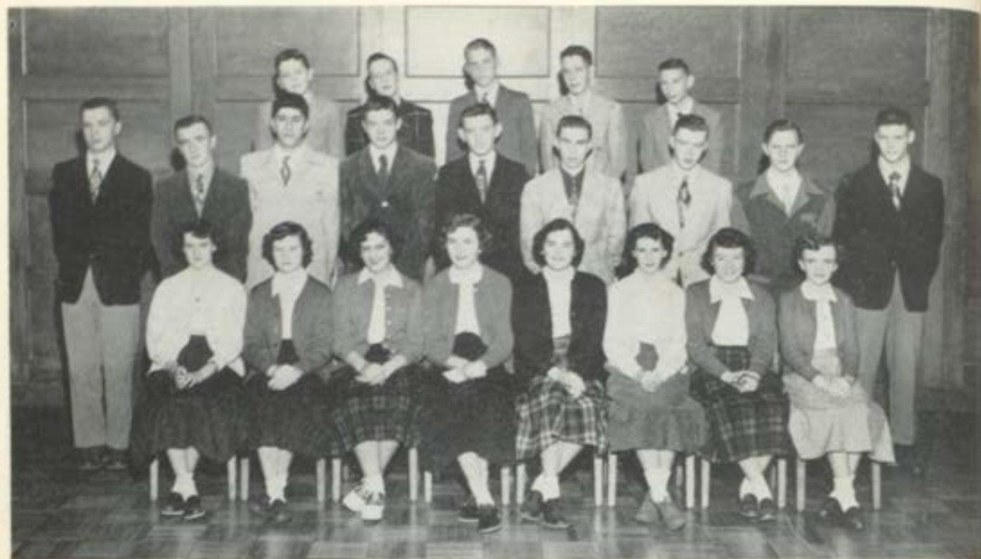
Sophomores — Class of 1954