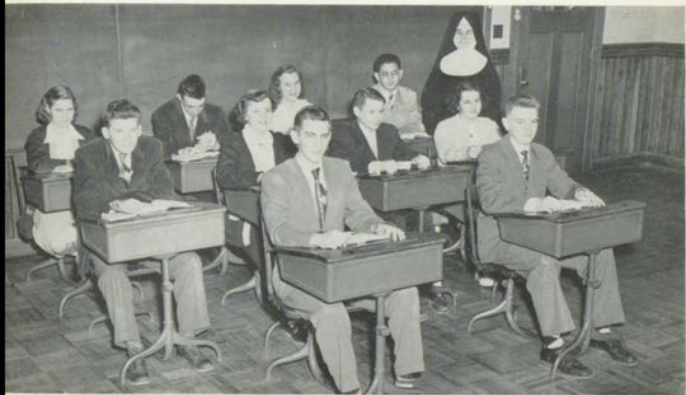
We Learn the French Language