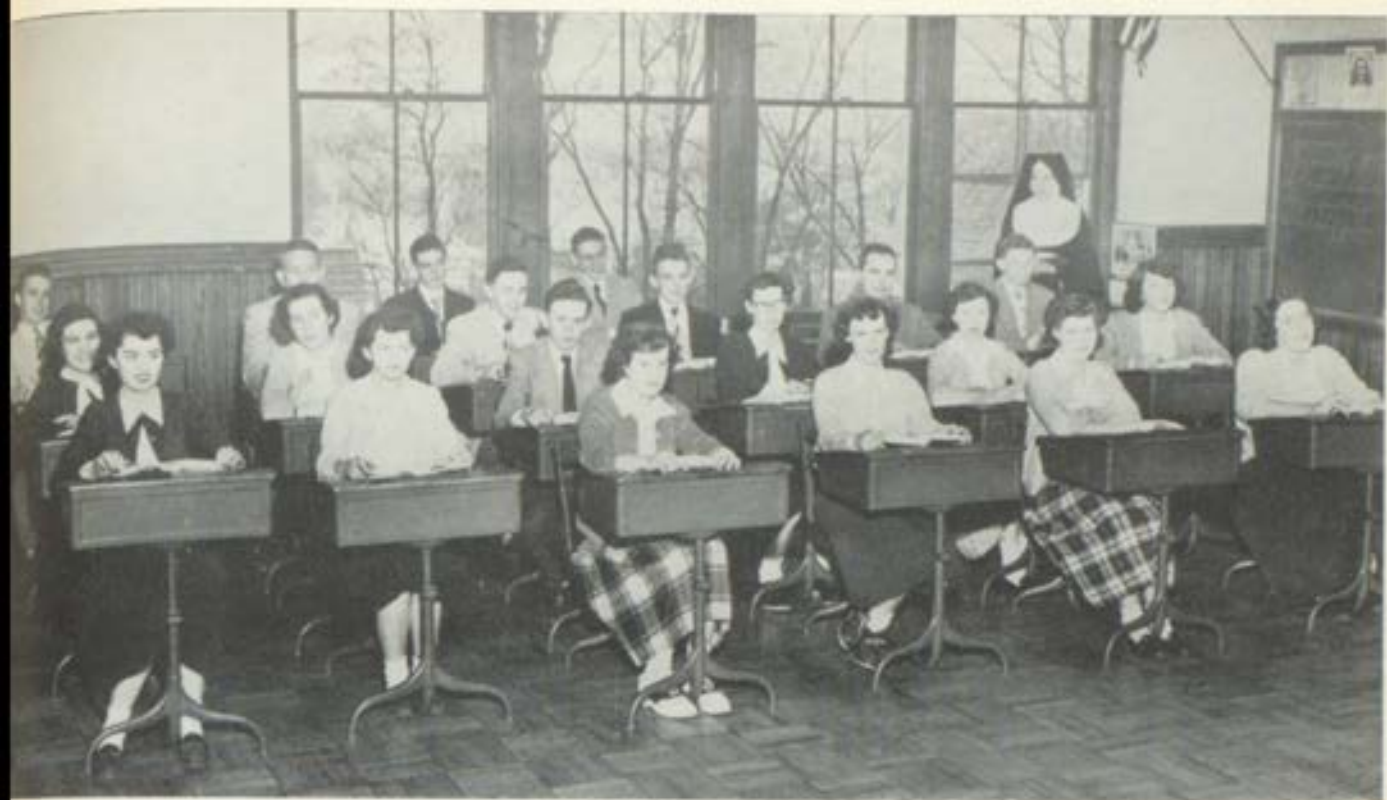
English Class in Action