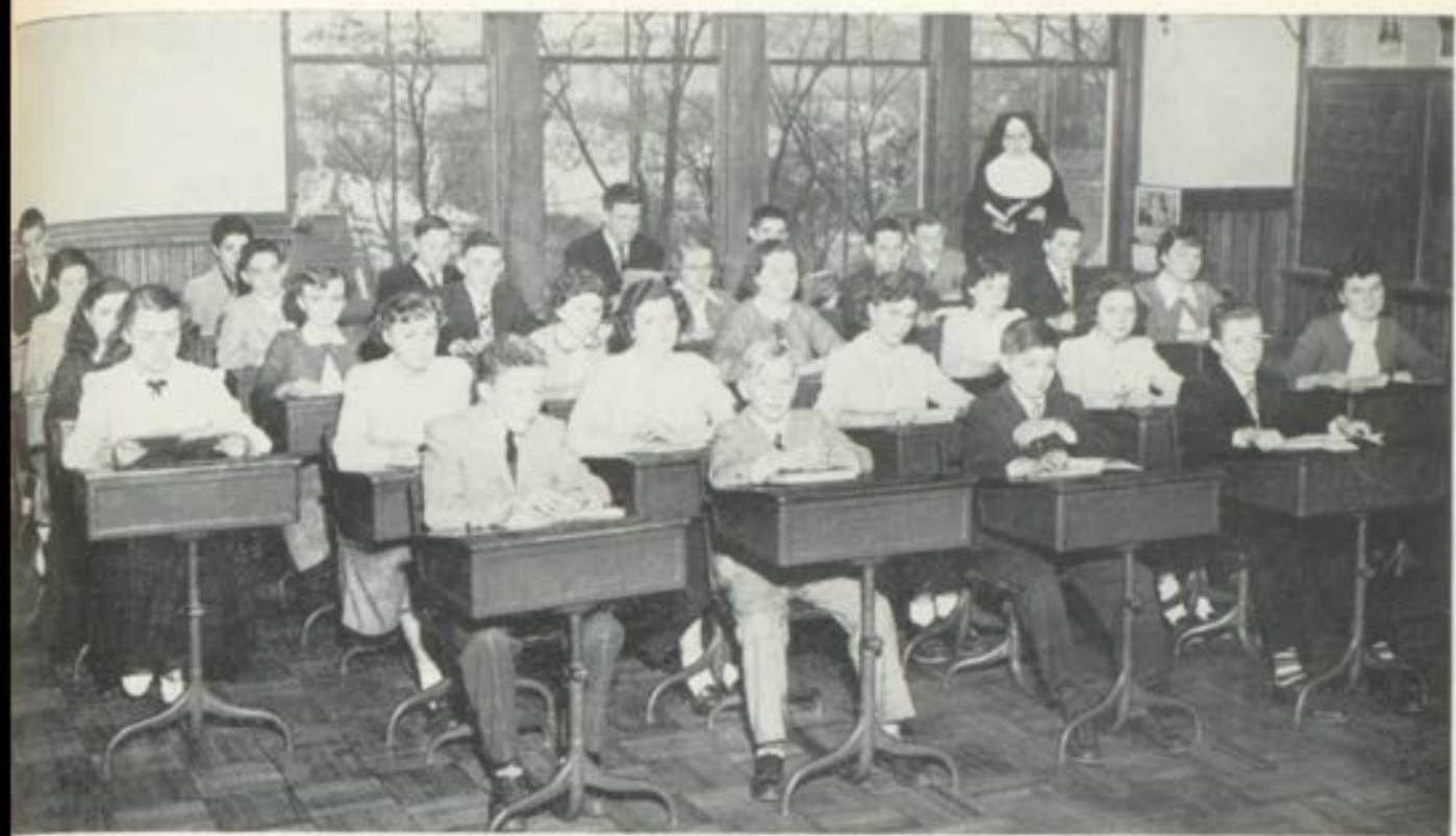
Social Studies Class Settles World Problems