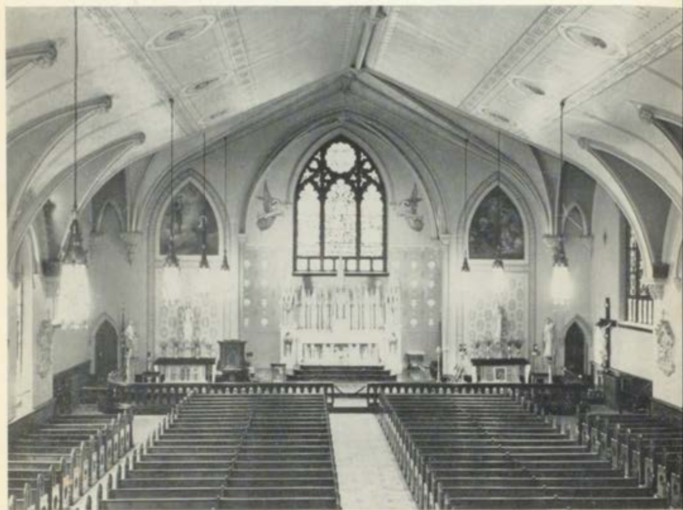
Interior of Immaculate Conception Church