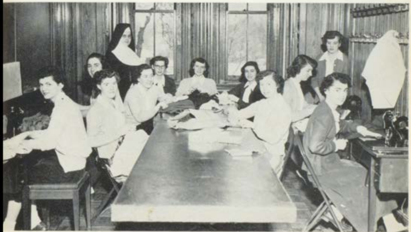
"As You Sew, So Shall You Rip"