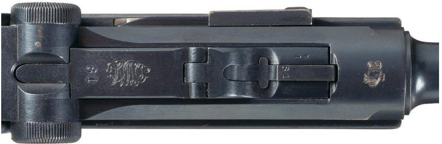
Early DH Type 1 SN 3281

Probably the earliest reworks, dating to late 1936/early 1937, with the early type ∞/skull acceptance is facing the "wrong" way. All examples of this variation are commercially proofed in the "Suhl" style, with the Crown/N stamped on the left side of the receiver and frame, the top of the breech block, and barrel. All chamber dates are scrubbed. Reblue and polishing is sometimes a bit amateurish.