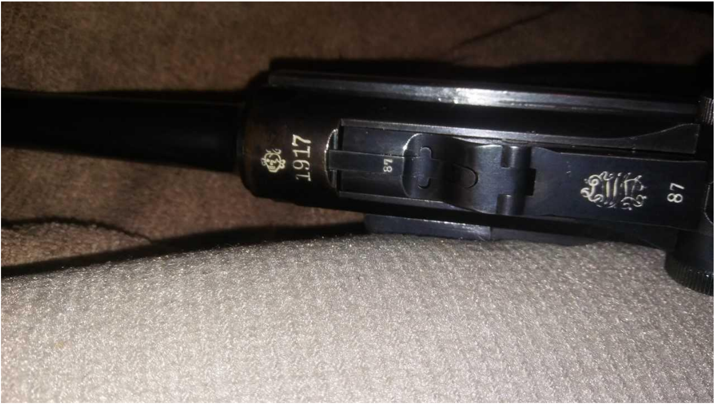
Type 3(?) SN 7076