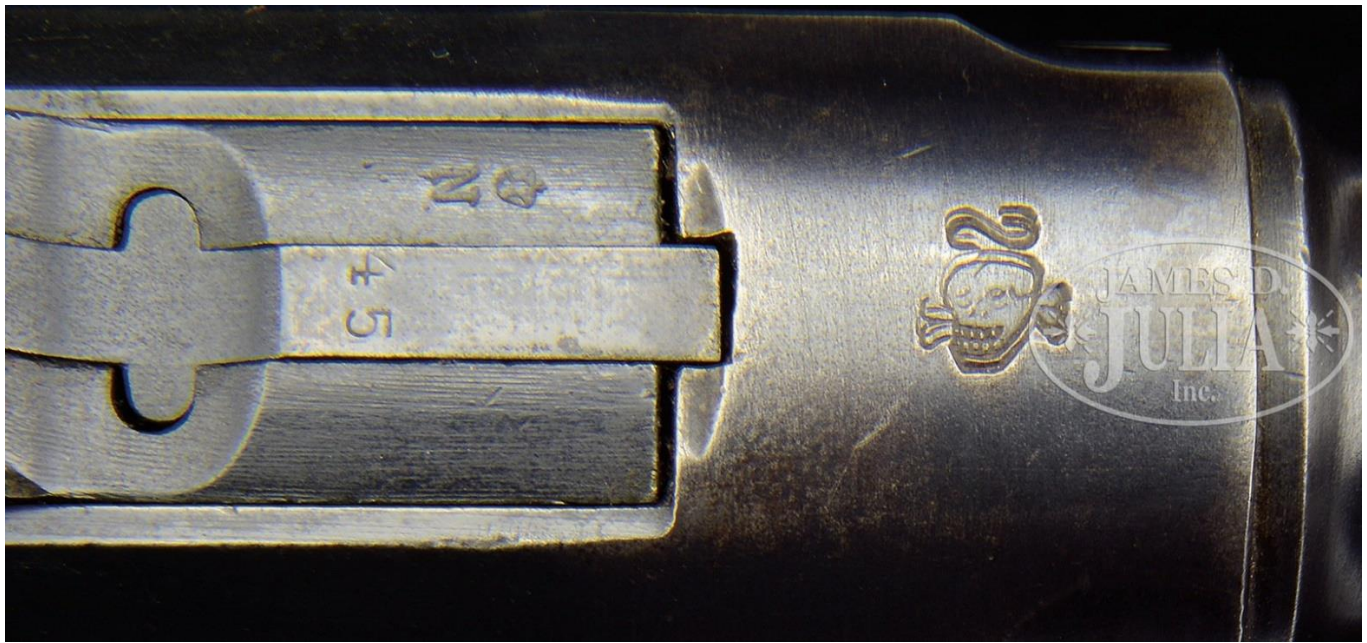
Early Type 1 SN 9450