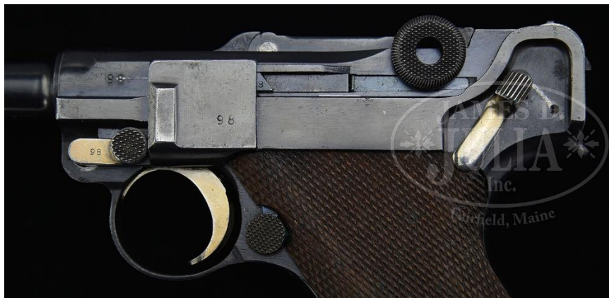
Type 2 DH SN 98

The Type 2 likely dates to 1938, and includes a change in acceptance die and a change in the proof house. The identical die used on these has been seen on SS Gew98 reworks, all of which have commercial proof dates in 1938. All of the Type 2 guns are proofed in the "Zella-Mehlis" style with the Crown/N stamped sideways on the right side of the receiver, the sides of the breech block and toggle, and the barrel. The barrel also has Zella-Mehlis style barrel gauge markings also. Chamber dates are no longer scrubbed. Note: (probably all) of the SS rifle proofing was performed at Zella-Mehlis.