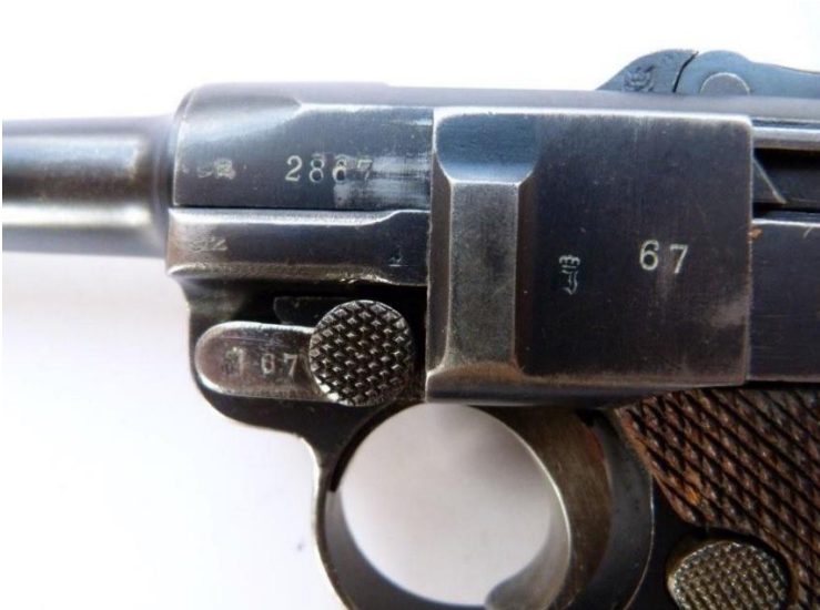
Late Type 1 DH SN 2867