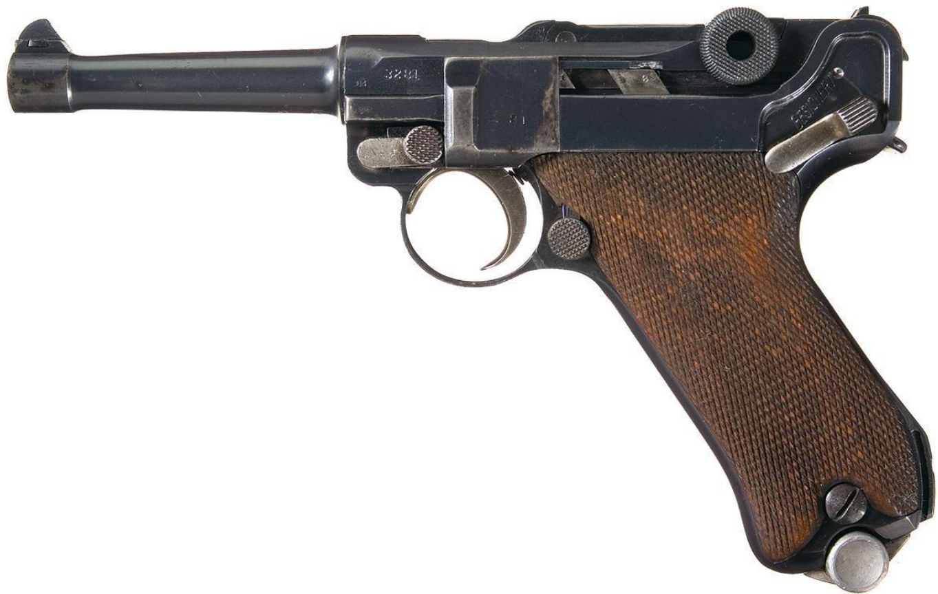
Early Type 1 SN 6745