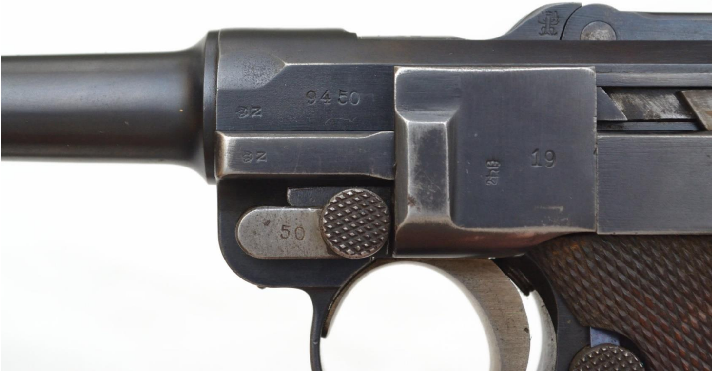
Type 1 (Subvariation 2) Identical to the 1st subvariation except the acceptance is stamped to face down the barrel.