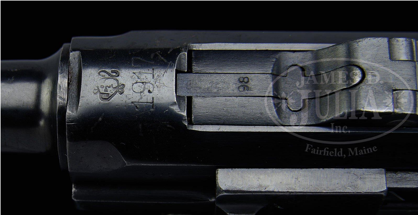
Type 2 DH SN 4984