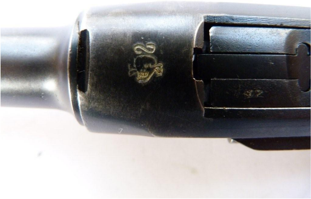
Late Type 1 DH SN 7609