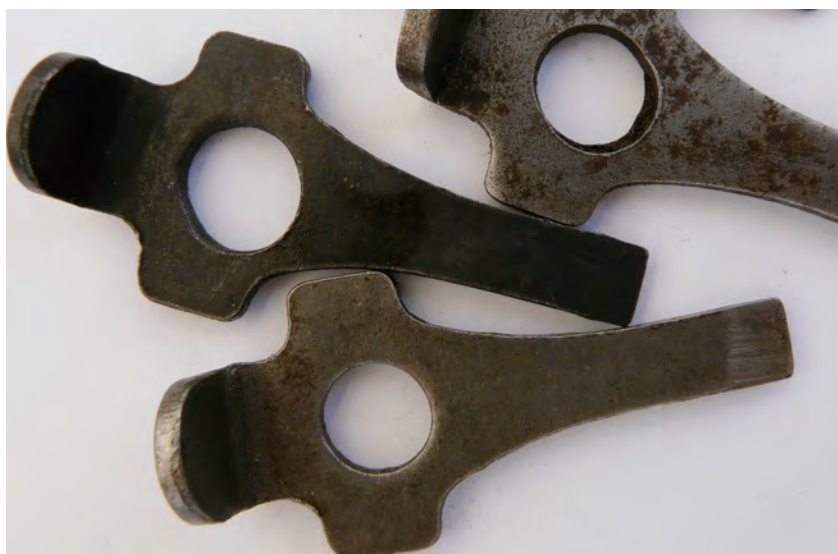
Often, the machine that should produce the knife edge in the central hole did not function correctly and went fully through the material.