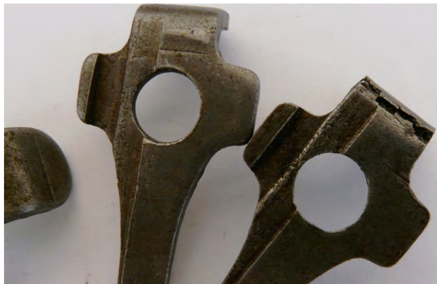
The bending tool was not well positioned and left markings. Sometimes the material broke.

This concludes my short article on the Parabellum pistol's loading tool.