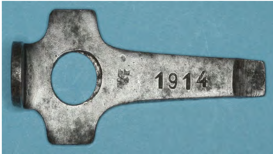
Many police tools have a property number as well as the acceptance stamp.

The "Luftwaffe" (German Air Force) procured their pistols and tools independently as well. The tools having a Luftwaffe acceptance stamp show the same color as the famous pistols, manufactured by Krieghoff. The appearance of this color is probably the result of bluing, not from tempering. The shape is very much like the Mauser tool, but all edges are smoothed with a file. Two different acceptance stamps can be found. The first stamp was made upside down, positioned just below the center hole and oriented to the left. This was not done accidentally; the place and regularity of this stamp leave no doubt that it is the intended position and location. The magazines of the Krieghoff pistols also occasionally display the upside down acceptance stamps. When observed from above, we find on top of the bent and rounded thumb lever of these tools at least one but often two small stripe-like markings. These marks occurred during the tool production. This marking and the special file strikes which go diagonally over the length of the tools are easily identifiable properties.