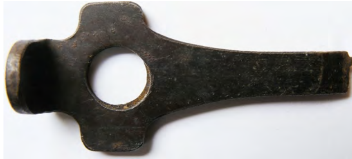
Unmarked Krieghoff tool

I believe that unmarked Krieghoff tools, not having a Luftwaffe acceptance stamp but having the properties of those produced by Krieghoff, were destined for the commercial market. These are even more rare than the Luftwaffe accepted tools, which are already a rarity on their own. See the tool below.