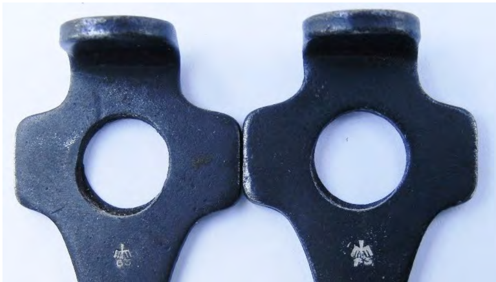
Two more droop eagle/63 variations: at the left is the most commonly found. The one at the right shows the stamp which was used in spite of the fact that the "6" had partly broken off. It is interesting to note that it was not immediately replaced.