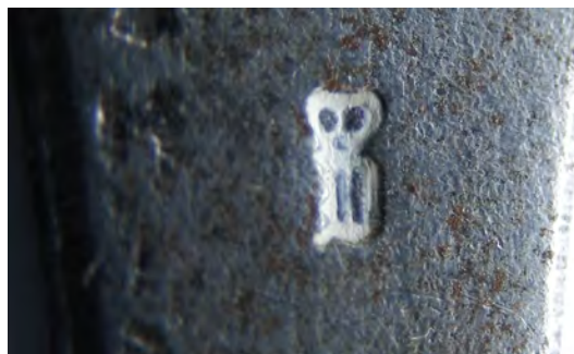
Above is a tool with an acceptance stamp, that was found on the Parabellum pistols of the 1902/03 German Army pistol trials

In the US, another screwdriver having this acceptance stamp emerged. The measurements and finish are comparable to tools that were later produced by DWM. This fact undermines my long cherished theory that the tools that were issued with the test pistols during the German pistol selection trials were the only ones that ever had the two-lobe crown over "D" acceptance mark (Danzig Proof).