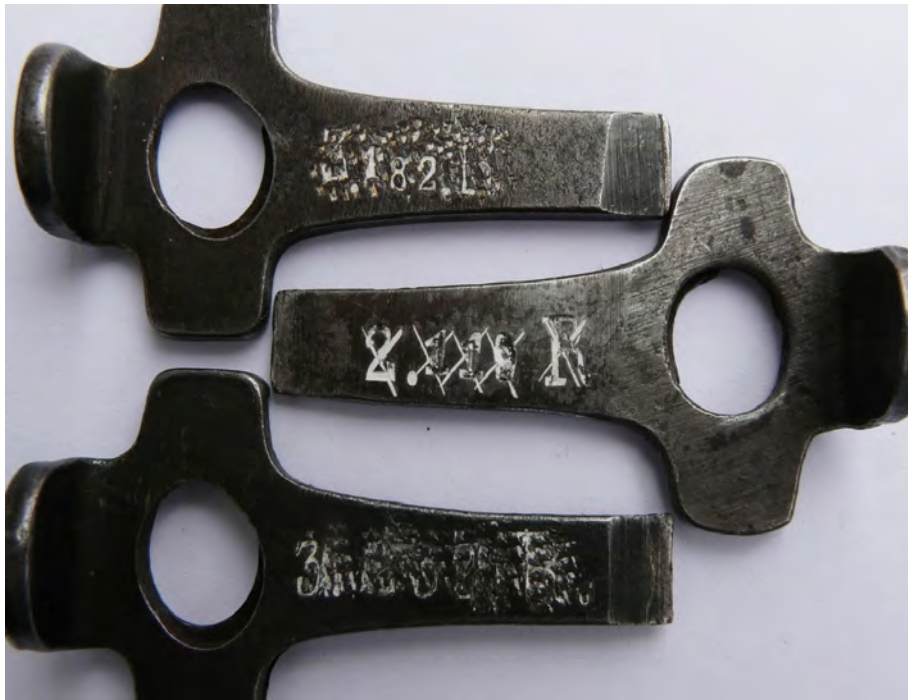
The tools above show the former "Revierhauptmannschaften" stamps. On the back side of each, there is a four digit pistol serial number.