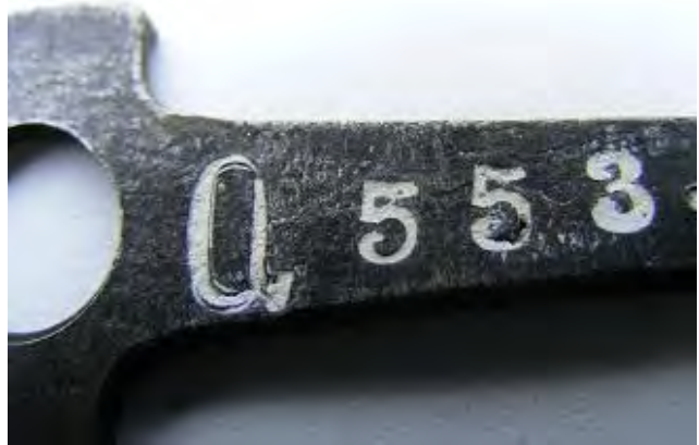
The tools, belonging to the P.08 pistols of the navy station for the Ostsee, do not have acceptance marks. From 1935 on, these were marked with the property numbers of the pistols.

In the journal of the Ministry of the Interior of April 12, 1922, an illustration of a tool can be found that shows the identification markings that were found on the early police tools. The tools were stamped on the top side of the blade (beginning at the top of the shaft) with number of the “ Hundertschaft ” (group of one hundred) with a height 3.1mm and the property number of the pistol (height 2.1mm). The arms of the so-called “ Revierhauptmannschaften ” (District Main Police Station) had the same stamping with the addition of an “R” at the end for additional identification. See the photos below.