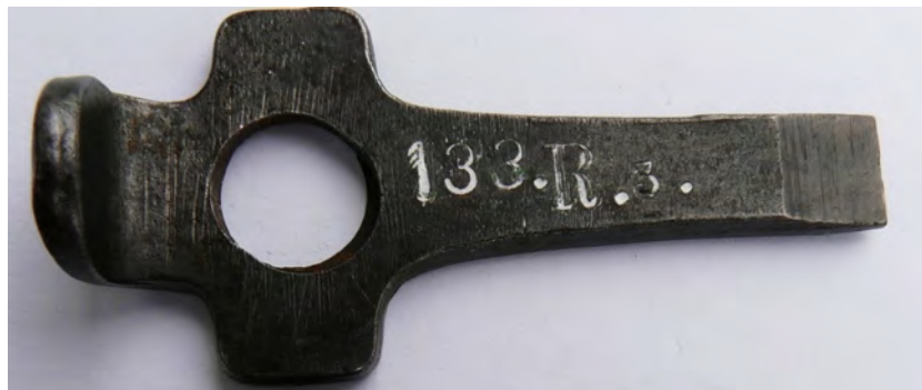
A tool having a marking of a Saxon unit: Reserve Regiment number 133, Third Company

Sometime between the end of 1915 and the beginning of 1916, there is a change in the shape of the tools of both manufacturers. At the state rifle factory at Erfurt, the corners of the "T" (flanges) crossing in the middle were rounded off. The tools of the private company, DWM, show a narrowing of the blade under the "T" crossing. This exact shape will be maintained into the early Mauser K date production (1934) of the P.08 pistol.