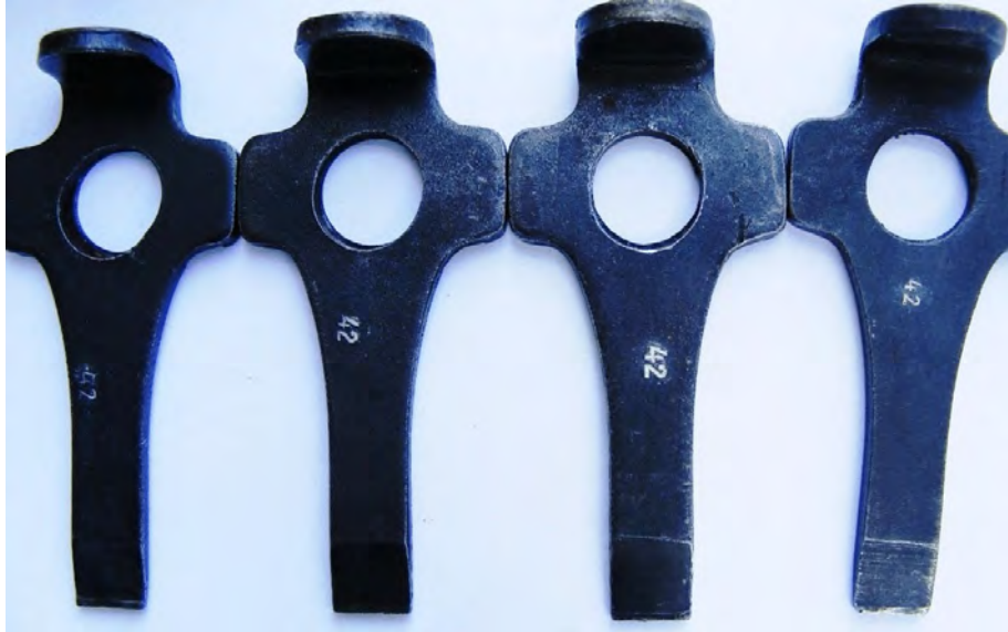
The code 42 Mauser replacement tool stamp is found in two sizes plus some small differences create variations.

When tools were lost, replacements were available. During the III Reich period, these were stamped with Mauser's army production code, before 1939 S/42 (photo above), thereafter the 42 (photo below). The Mauser S/42 stamp is known in two very slightly different variations.