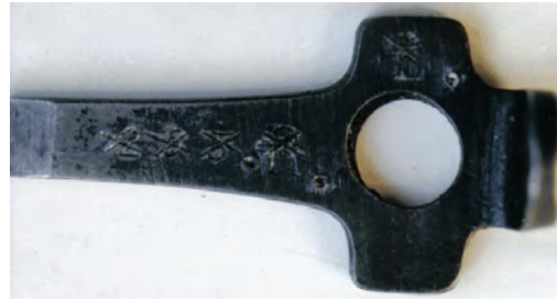
Above and below are many tools from the era after WWI that have various police stamps. The meaning of the "L." is not yet known.