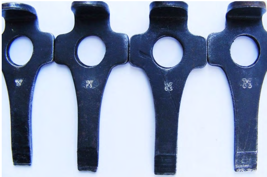
During 1937, the eagle received “stick” wings. The mark has four different sizes and each size can be found in two slightly different patterns.