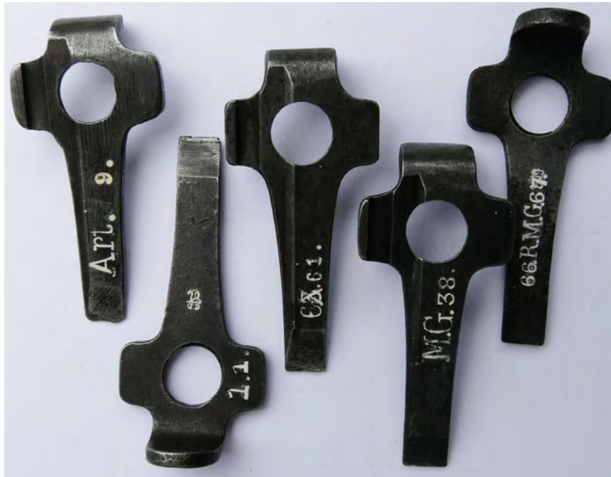
These tools from the Imperial era have various unit markings.

Only very few tools have been reported that have unit identification stamps on the front or back side. There may be one or more unit markings on a tool due to re-naming or re-assignment of pistols or units. Certainly these were stamped by the "old" Imperial Army, mostly for machine gun units.