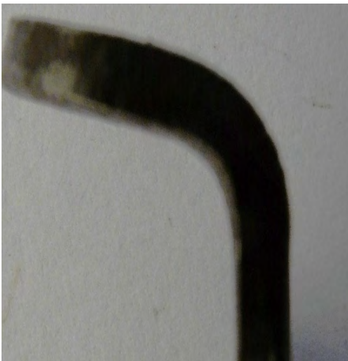
Sometimes the right angle of the thumb lever was not reached.