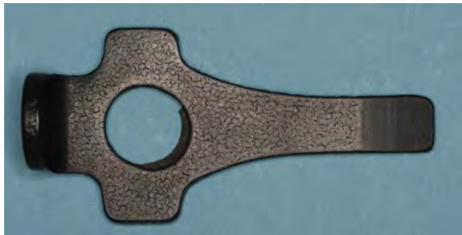
DDR loading tool detail 1958: note the crackled surface and the serrations on the thumb lever.