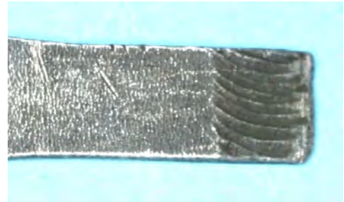
Note machine marks on the blade

As both the DDR and Kongsberg tools have been available in large quantities and at relatively low prices, they were purchased more and more for forgeries. When rare and sought after tools reach prices of hundreds of dollars/euros, an “upgrade” seems worth the trouble. Therefore it is very important for any potential purchaser of such a piece to learn the specific properties of these tools. I am fairly sure that it is impossible to fake a tool. There are always sufficient points of judgment enabling us to recognize a forgery. Without going into more details here, it must be stated that both the tools made in the DDR and in Norway have specific characteristics which make them recognizable as post WW II production. These forgeries may be quickly identified for what they are. The production of tools in the DDR took place during 1958 and 1959. These are easy to recognize because the distinctive structure of the material, the eight serrations under the thumb lever, the typical dark bluing, and occasionally the crackled finish.