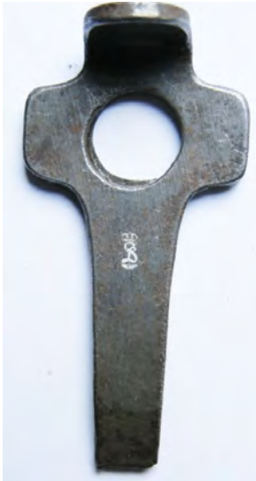
S small underlined