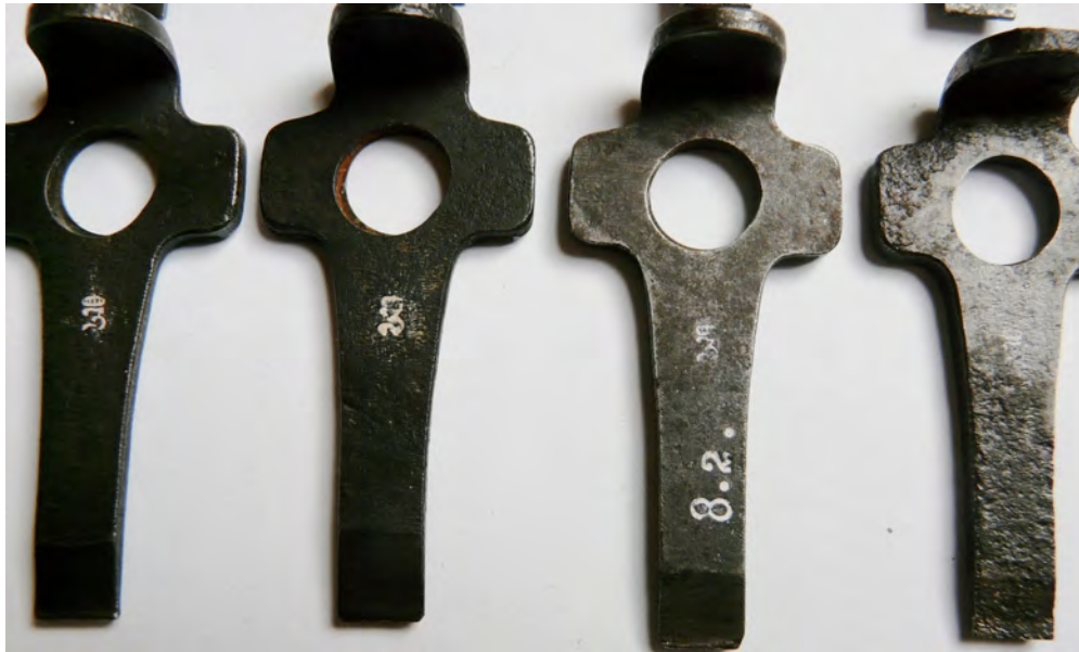
These tools have typical acceptance stamps, which are also found on early DWM P.08 pistols.