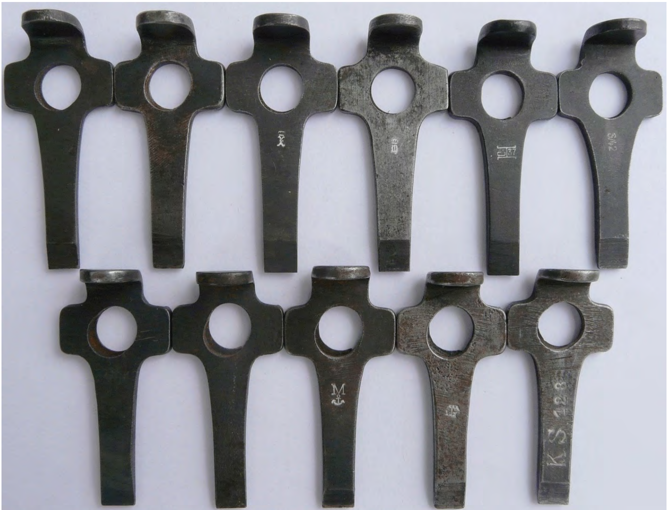
Above, from left to right: two commercial tools model 1906, one tool commercial/army, one from Erfurt, an early Mauser K-date from 1934, and a replacement tool made by Mauser. When compared with the row of tools from the Weimar Republic below, the larger knife-edged rim in the central hole is strikingly evident.

Apart from the fact that the edges are not worked with a file, there is another property that helps to identify the tools of the Weimar Republic. The knife-edged rim, which is so important for the loading of cartridges, is more prominently shaped. These properties indicate that the production of the tools was based upon a separate drawing and that they were very probably procured from one single source.