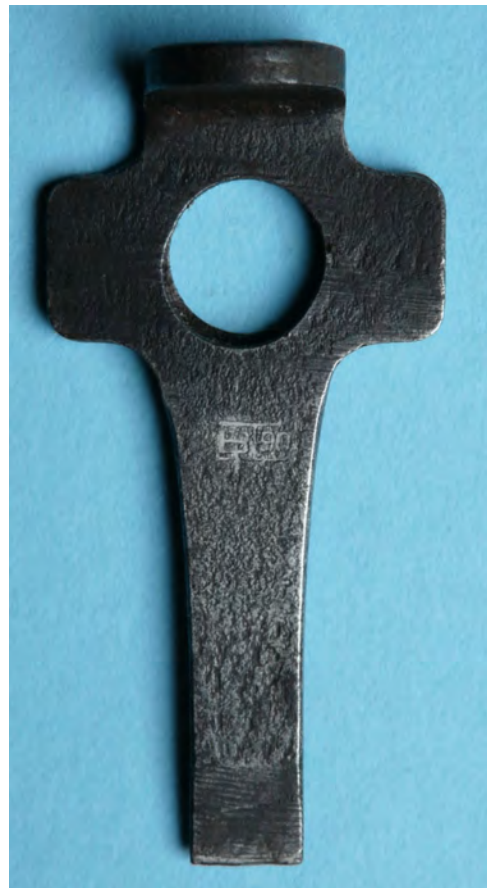
The first screwdrivers supplied by Mauser still have their original DWM shape.