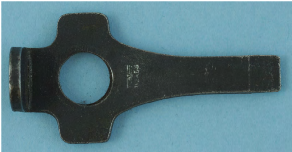
This tool has the very rare eagle/WaA63 acceptance stamp; until now, it has not yet been precisely scheduled in a time frame. Due to the stick winged eagle, it is safe to presume 1937-1939.