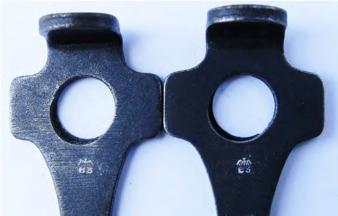
From the end of 1935 to mid-1939 Hauptmann (Captain) Krimer was the army official for the acceptance procedure at Mauser. He used the code 63 under an eagle; the droop winged variation is shown above. These stamps are small, just as on the right receiver of the P.08 pistols.