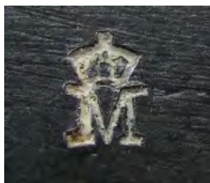
German Naval Mark on key circa 1910

The model of the Parabellum pistol that was introduced in 1904 for the German Navy also had a helpful accessory, the tool. The first stamping of the navy acceptance stamp might have taken place with the delivery of the larger quantities in 1906 or even in 1910. Until now, only the second version acceptance stamp pictured below has been found on these tools. The early acceptance stamp, as found on the navy pistols having the long frame and the grip safety, has yet to be found on a loading tool. The navy tool had the absolute same shape and measurements as the 1906 commercial tools.