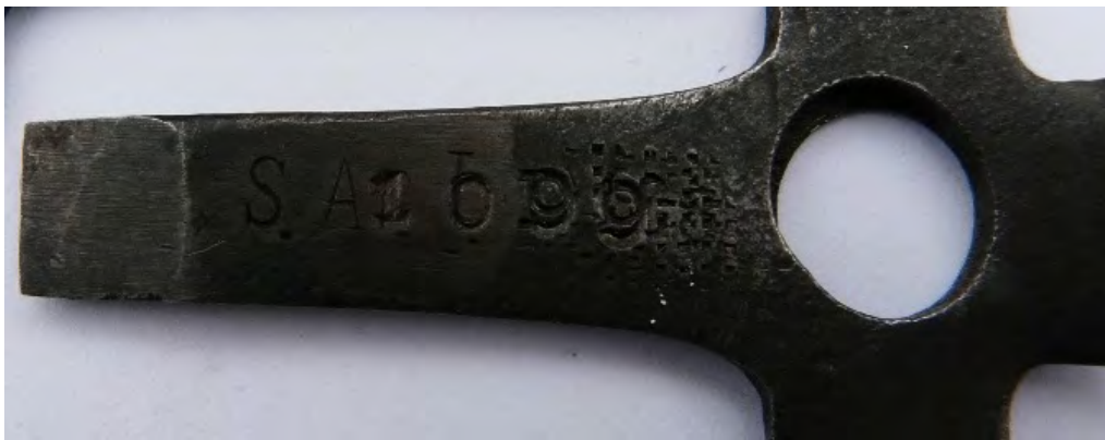
Tools for the Schutzpolizei Arnsberg were produced in a separate batch and have unique measurements.