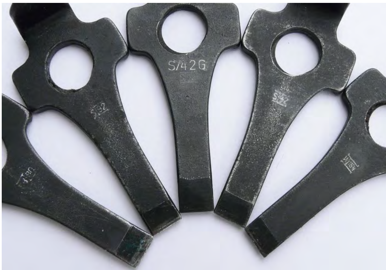
The blade tips of the early Mauser tools are really narrow on the front side. The tip of the screwdriver in the middle of the picture above has even been tooled afterwards and lengthened. From 1935, at the late W|154 stamps, the blade tips show a longer shape. From 1935, we also find unmarked pieces.

Only the very early tools (of the thank goodness only few years enduring) of the “Thousand Year Third Reich” showed the stamps Ö|37 and B|90 (1934) and have the DWM shape. All but a few do not have the DWM tempering color. A study of the production marks on the actual sheet steel the tool is stamped from leads me to believe that these early tools did not come from DWM stocks but were produced by Mauser. From 1935 (G-date pistols), the tools show the typical Mauser shape. This shape resembles the Erfurt tools; only the “shoulder” under the round hole is wider. The first five acceptance stamps on these tools do not show an eagle; only at the end of 1935, the first eagle appears (droop-eagle/ 211). Again, within the various batches of ordnance pistols produced for the German Army, we find exactly the same acceptance stamp on the right receiver and also on the screwdriver. The screwdrivers are made from hardened spring steel, 3 having a percentage of 0.8% carbon. Only the lower left side of the tools have smoothed edges. The very homogenous tempering color was obtained by submerging the tools for five minutes in a salt bath, having a temperature of 380°C (716°F). The early tools, having the acceptance stamps Ö|37 and B|90, may partly show no tempering color. 2 The material of these white tools will be like the tools of the Reichswehr period. Time and conditions may have allowed a coating of patina to appear and darken the appearance. 2 See the eagle/SU25-marked tool on page 10.