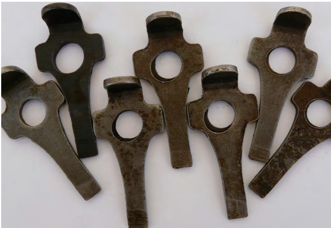
These screwdrivers were rejected during production.

I would like to close by showing some tools, which justly did not received an acceptance stamp.