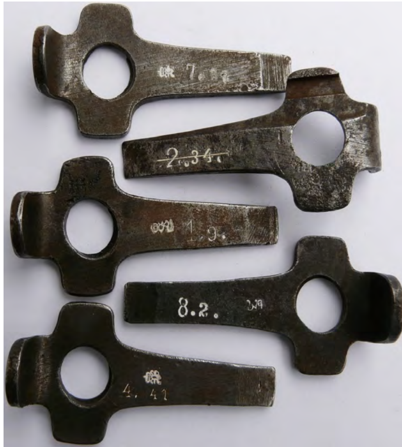
These five screwdrivers show Imperial acceptance marks as well as the Weimar Republic Police unit marking as directed in 1922. Note the "Hundertschaft" as well as the arms number.