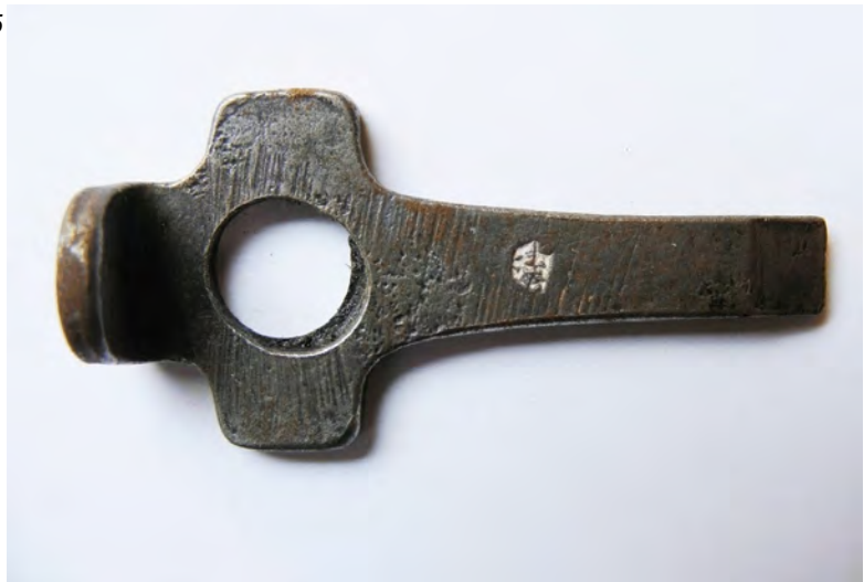
Eagle over SU/25

Tools from the Weimar period are in the white. 2 There is no protection from corroding. The tools marked with eagle/6 were delivered with Simson-produced pistols. Only these will show sides smoothed by a file. They will have the late Erfurt shape. All others from this era will have the late DWM shape and color. Variations of the Weimar period are as shown. Above are three variations of the eagle/6 acceptance marks, which may also be found on the right receiver of the Simson-produced pistols. Notice the eagle/SU25-marked key illustrated below.