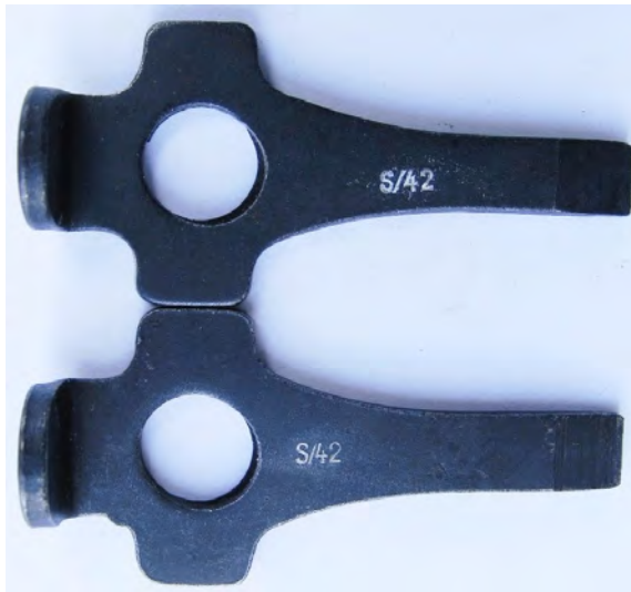
These are code S/42 Mauser replacement tools.