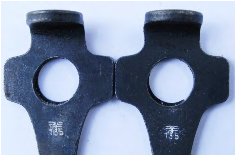
From the end of 1941, another change of inspectors took place; Major Rosenhagen used the number 135. As on the pistols, there were two slightly different shapes of eagle/135.