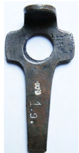
S large underlined