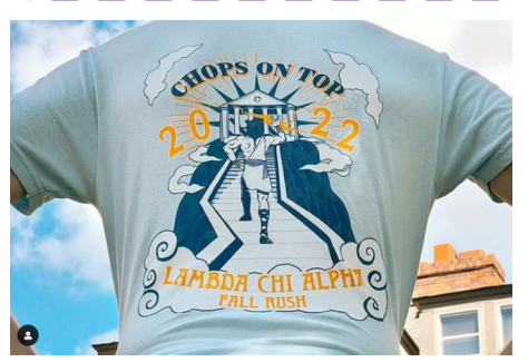
Fall 2022 Rush T-shirt

Although we have not yet finished this fundraiser, we have been having an absolute blast participating so far!