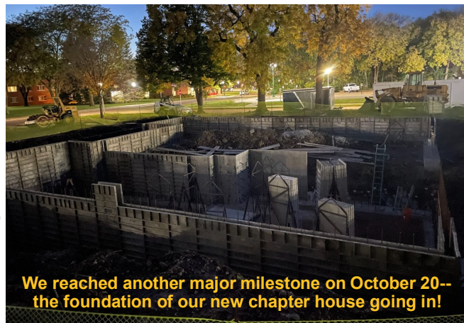
We reached another major milestone on October 20-- the foundation of our new chapter house going in!

"The sense of community, camaraderie and the values upheld by Lambda Chi Alpha always seem to resonate strongly with potential new members. As a result, the chapter has welcomed an outstanding group of new members, showcasing a promising future for the fraternity during this time of change as our new house continues to go up," the High Delta stated.