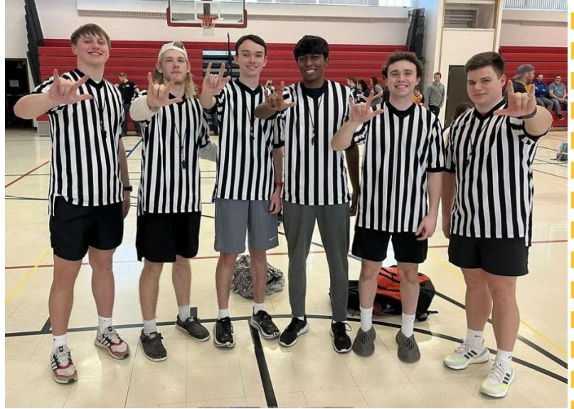
Actives volunteering as referees for the Southeast Special Olympics Basketball Tournament in Yankton.

Brothers of our chapter have spent countless