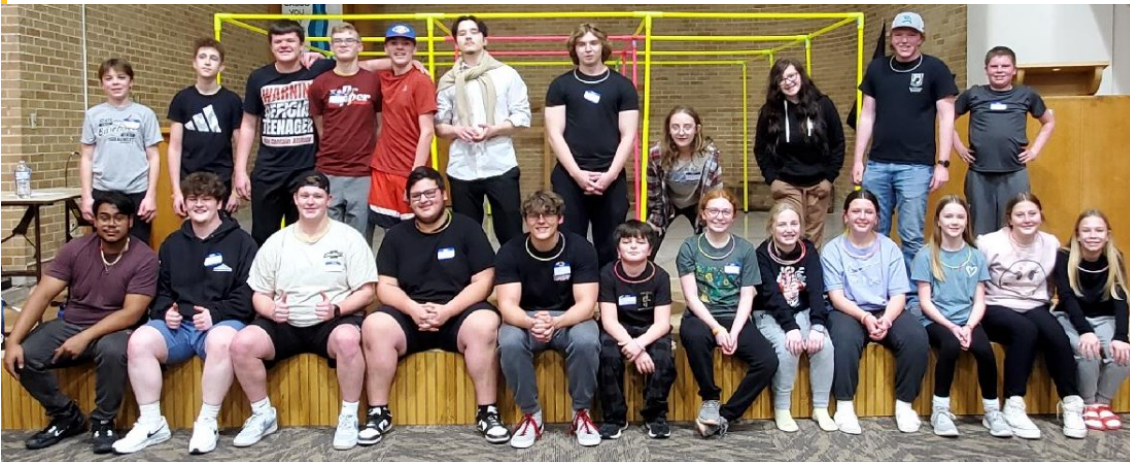
Volunteering at Trinity Lutheran Church of Yankton's confirmation lock-in.

Lambda Chi Alpha is doing on campus, in the community, and even the state as a whole.