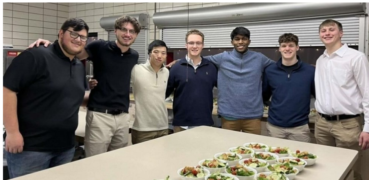
Serving at the St. Agnes Catholic School Classic fundraiser.

hours invested in service this past semester. Including but not limited to serving at the St. Agnes School Classic, fundraising for the Vermillion Polar Plunge in support of South Dakota Special Olympics, volunteering as referees for the Southeast Special Olympics Basketball Tournament, and volunteering at Trinity Lutheran Church of Yankton's confirmation lock-in.