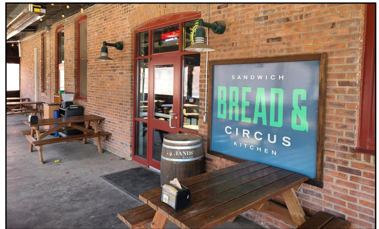
Bread & Circus Sandwich Kitchen at 600 N. Main Ave. in downtown Sioux Falls

In addition to Bread & Circus, Putzke also owns Pizza Cheeks at 120 South Phillips Avenue. “Some friends opened the Hello Hi bar which had room for a kitchen, so we created Pizza Cheeks. It’s a window in the back of the bar, and we serve mostly by the slice.”