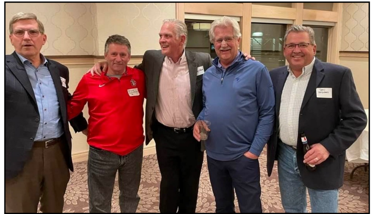
Alumni at Founders Day 2022