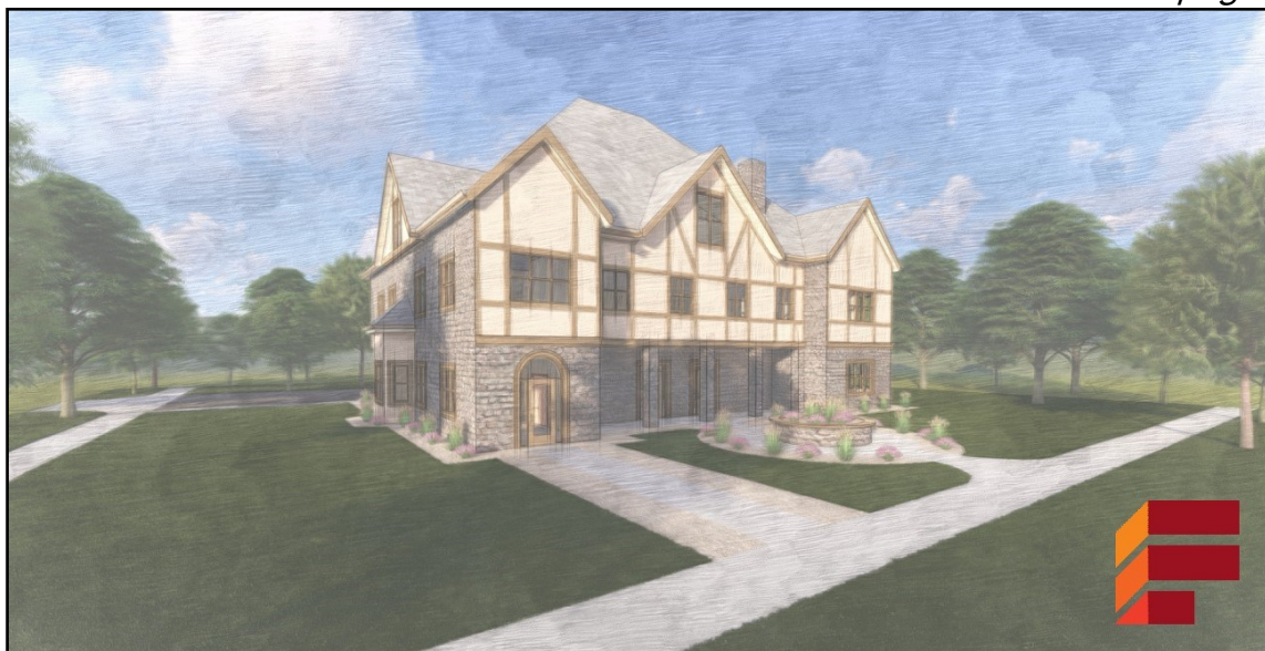
The latest rendering from Fiegen Construction of Sioux Falls

While we hope to meet this goal by the end of this year, the campaign will continue through the spring to raise an additional $500,000 for a Maintenance/Contingency Fund. We want to give every Brother, no matter his financial situation, the opportunity to be part of this historic new chapter in Lambda Chi Alpha's history at USD. continued on next page