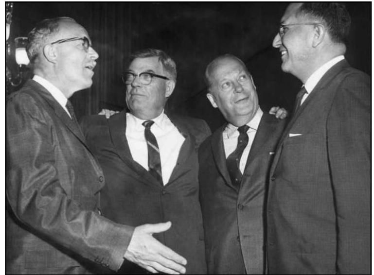
In this relatively well-known photo, South Dakota's congressional delegation in the 87th U.S. Congress is pictured, half of whom were Lambda Chi's.

Born in 1902, he grew up in Philip, attended Morningside College, and graduated from the University of South Dakota School of Law in