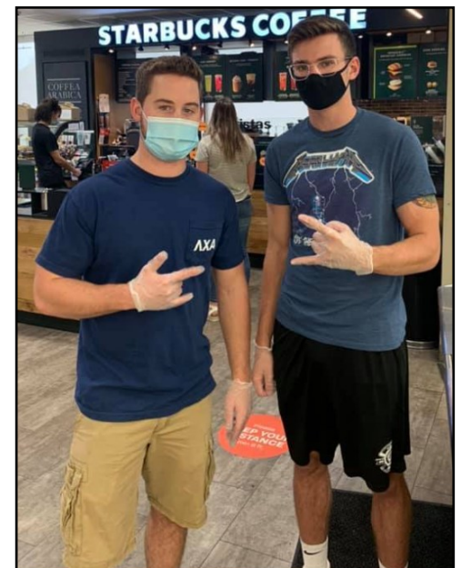
Photos from Greek Week during the time of Covid-19, Fall 2020.