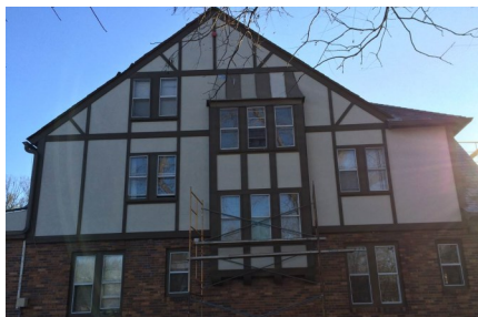
North Side of the Chapter House with New Siding

This renovation builds upon recent Housing Corporation renovations including the remodeling of main floor and complete renovation of 4 chapter house bathrooms. The