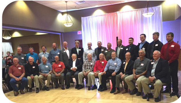
Brothers at the Rapid City Reunion

On Saturday festivities were held at the Arrowhead Country Club where