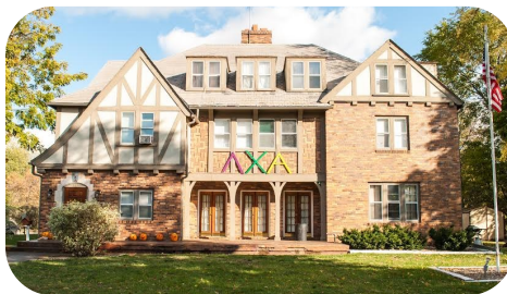
The Nicest House on Campus as Voted by Potential New Members

The Housing Corporation's goal is to raise at least $20,000.00 in alumni donations and pay for the rest of the project through the reserve fund. Please consider making a donation of $500, $250, $100, or $50.