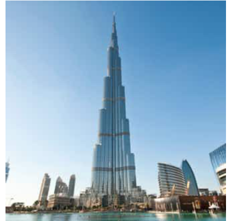
3 – Burj-Khalifa