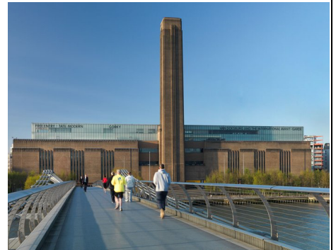
6 – Tate Modern