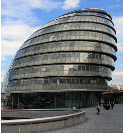
1 – London City Hall