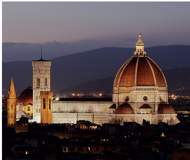
4 – Florence Duomo