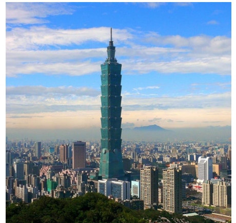
9 – Taipei 101