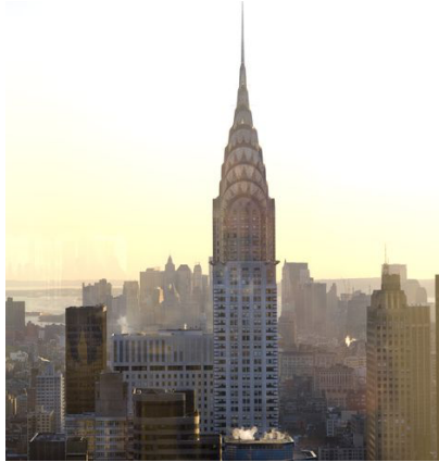
2 – Chrysler Building