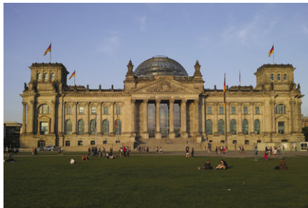
8 – Reichstag