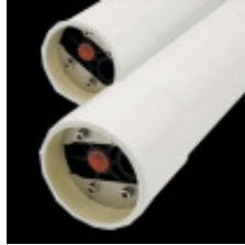
2.5" and 4"