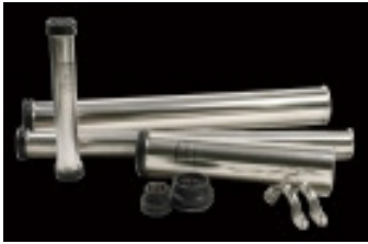
Membrane Pressure Vessels