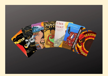
7-BOOK SET - <del>$106.00</del> $101.00

YouTube video,"We are all LIVING WITH TEXTURE!" and I finessed my website by adding an online SHOP. You can also shop for Kindle versions on my author's page with Amazon. NOTE: Books purchased directly from me will be signed.