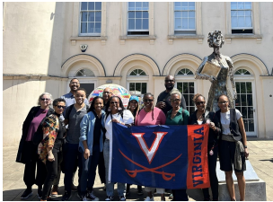
Claudia Vera Jones depicted @ Black Cultural Archives