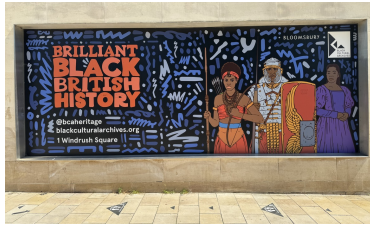
Black Cultural Archives