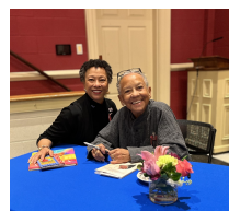
River Road Church "Distinguished Speaker Forum" (2023)