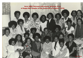
UVA's Kappa Rho Chapter with Soror Nikki (1975)

A phenomenally gifted poet/wordsmith, activist, educator, author, orator, etc. has gained her wings. I was blessed to have been in Nikki Giovanni's presence on a few occasions. I wish I could say I was named after her, but I know I was not!