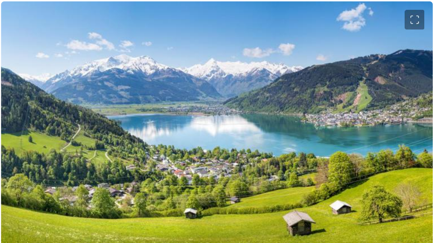
The world's 'best' villages for tourism have been announced

Zell am See is one of two Austrian spots on the list.