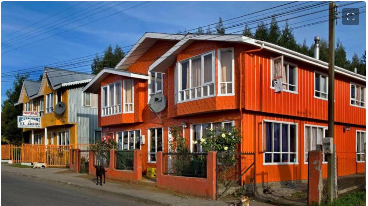
The world's 'best' villages for tourism have been announced

Puqueldon on Lemuy Island in Chile made the list.