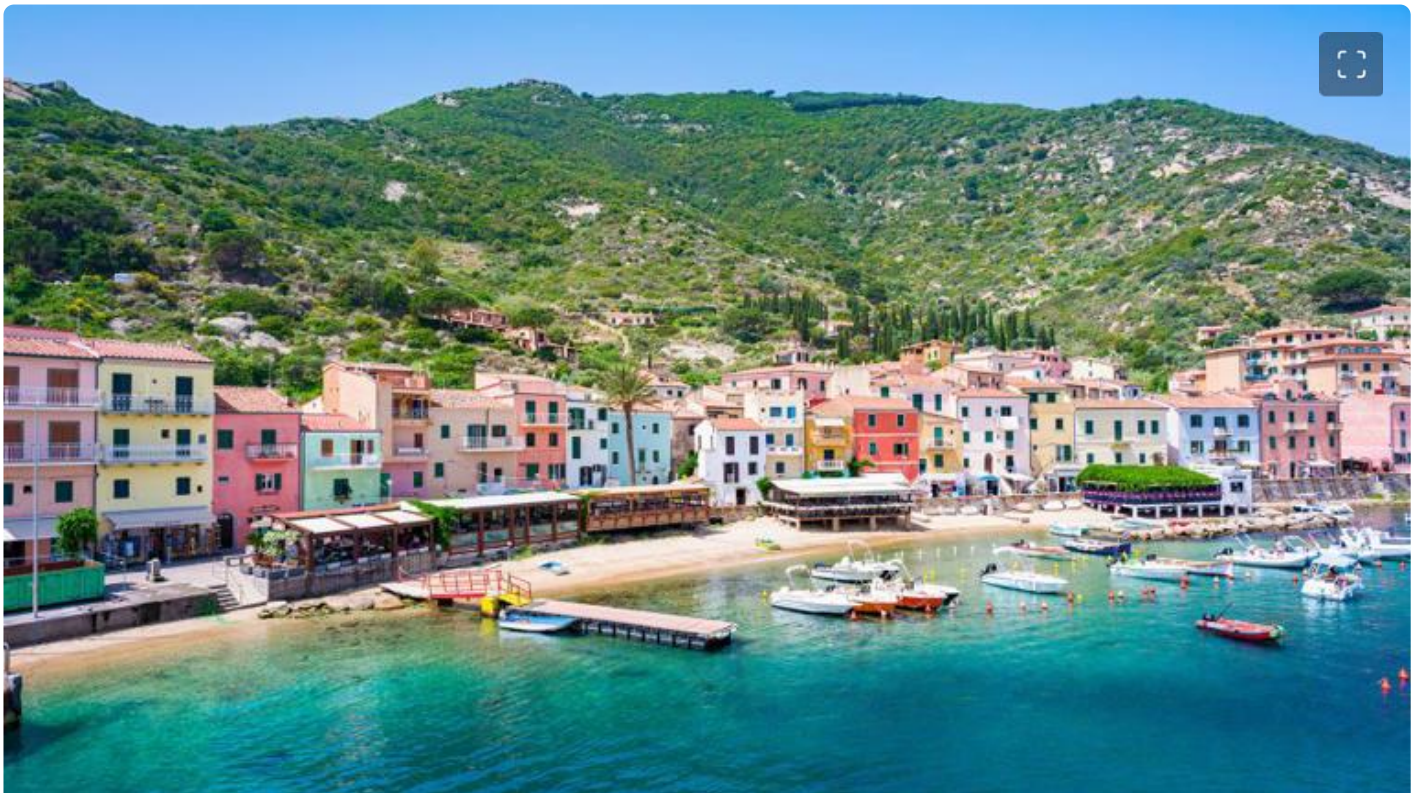
The world's 'best' villages for tourism have been announced

Italy's Giglio island also made the list.