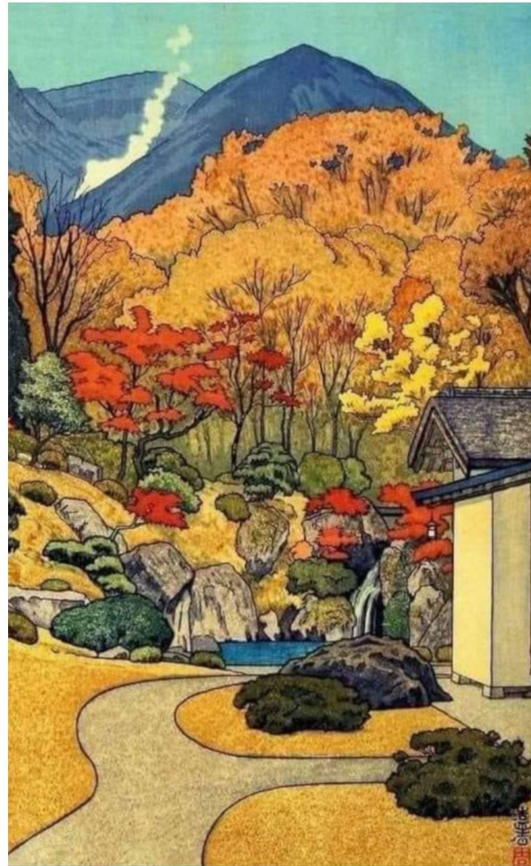
TOSHI YOSHIDA: AUTUMN IN HAKONE (1954)