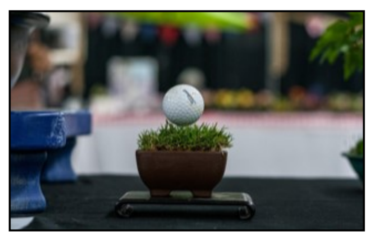
A little humor with the accent plant, which was with a boxwood collected from a golf course