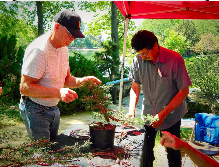
Below: The new work shelter in the reserve area of the Clark Bonsai Collection at Shinzen Garden