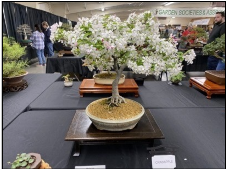
Crab Apple in full bloom by Mike Saul