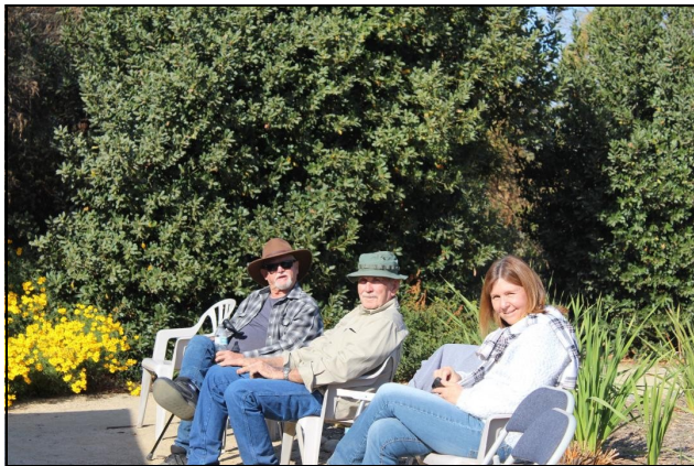
...and who could complain about the ideal weather! A great day with great trees and great people!!