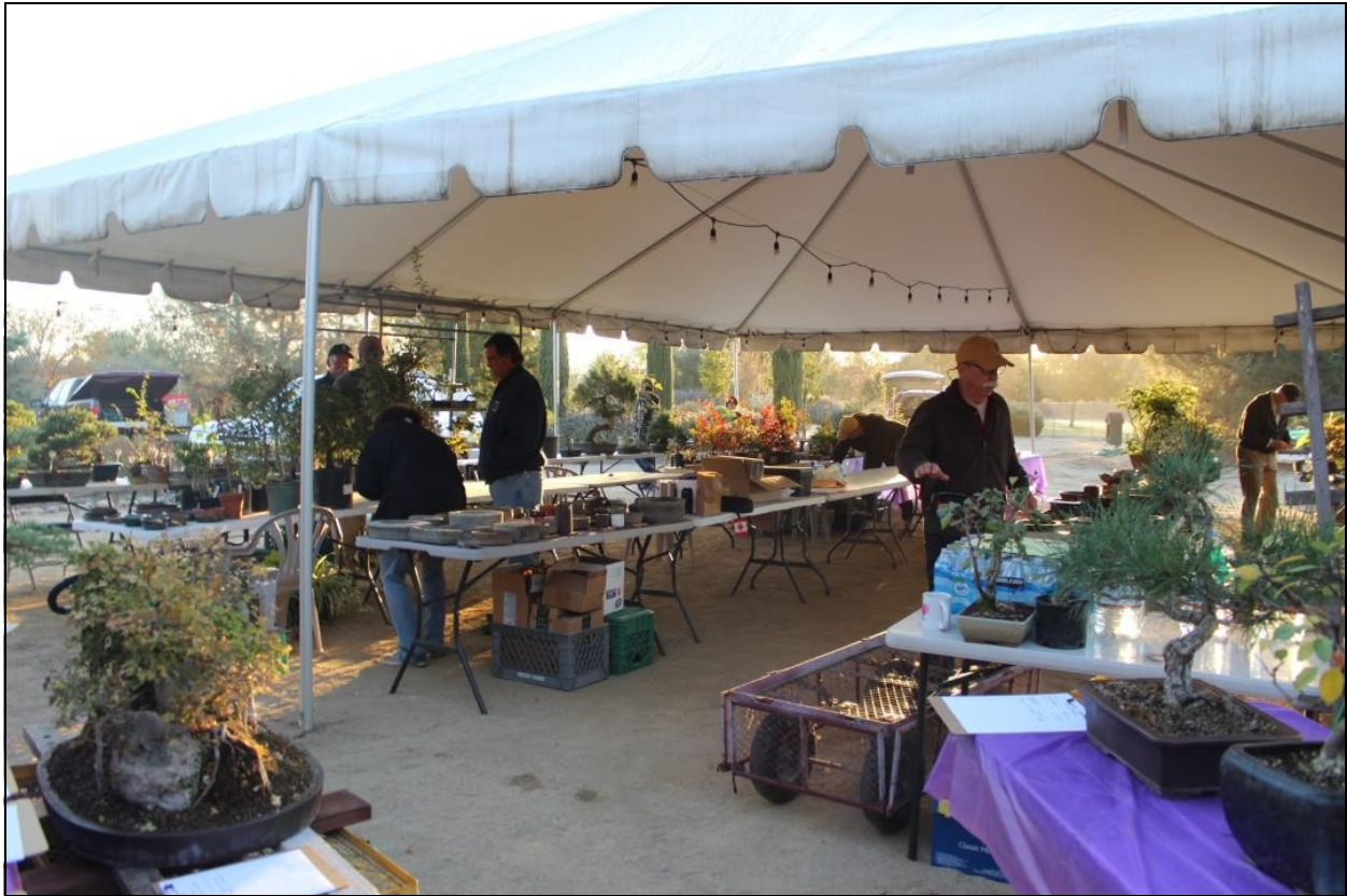
The facilities and the setting at the Clovis Botanical Garden were wonderful for the Yard Sale...