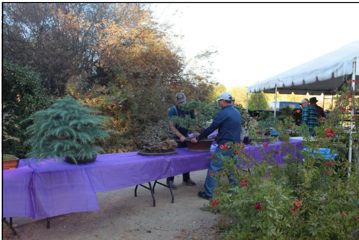
Bonsai Yard Sale venue at the Clovis Botanical Garden