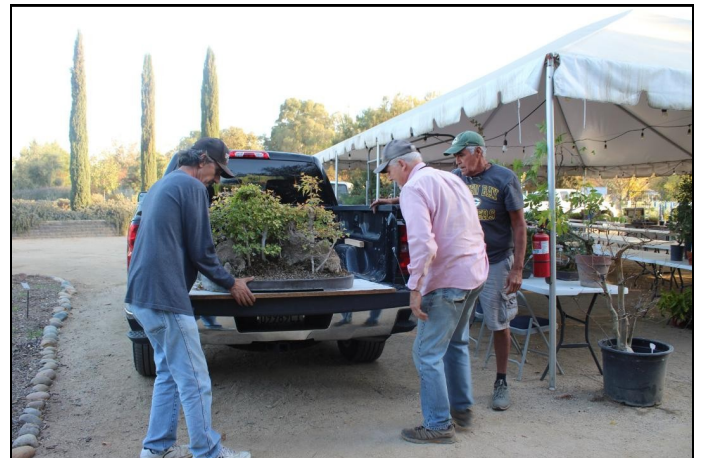
Great participation from club members and vendors