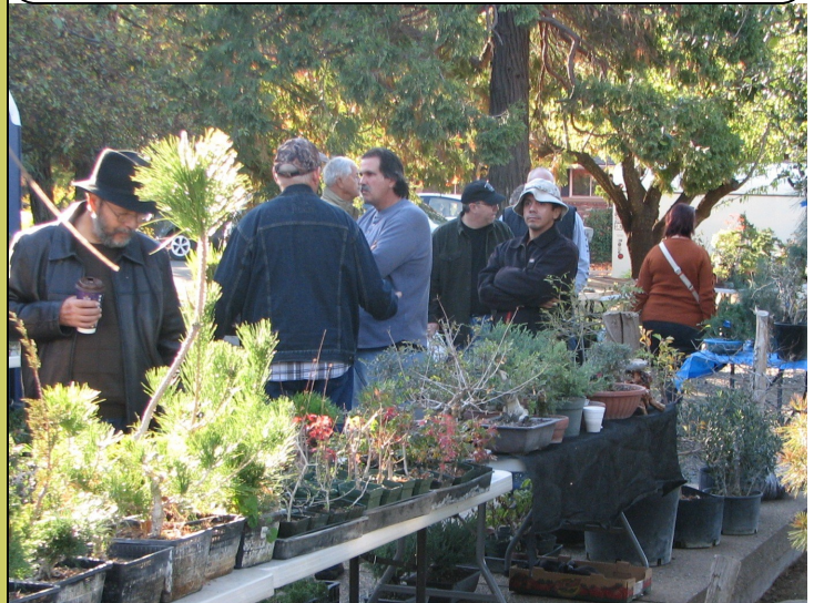
Above and below: The yard sale has attracted more buyers and more sellers each year. Buyers from Sacramento, the Bay Area and the Los Angeles Basin arrived early this year.