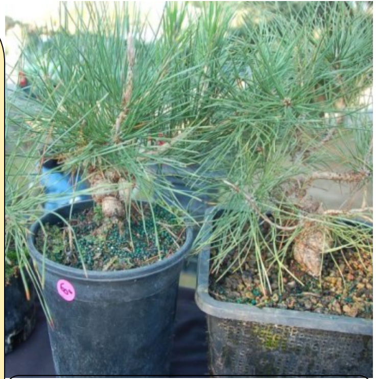
Above: Shohin black pine, developed over 5 years by Ed Clark at Round Valley Nursery

For more information or to secure your reservations, contact Ed or Linda Clark at 559 310-1513 or 559 359-6559. Or at lecclark48@gmail.com .