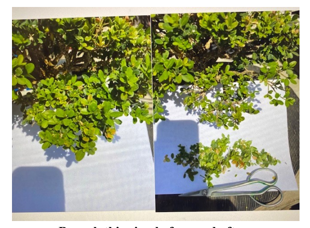
Branch thinning before and after.