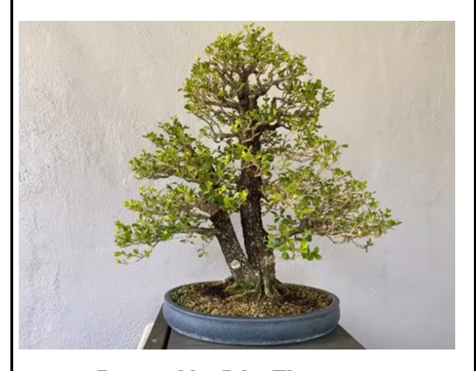
Boxwood by John Thompson

I must leave you with some advice. The trees that you are growing today are just in your care; they are not yours. Your signature trees will eventually wind up in someone else's hands. You never quit learning bonsai. Don't make your trees do something they are not physically capable of doing. There are many ways of doing things. There are no right or wrongs. If a concept is right for you, then do it. Never stop learning. Your trees will show it. Learn to read your trees. They will tell you what is needed if you are observant. Ninety-nine percent of deaths in bonsai trees are operator error. You never buy a perfect tree, so learn the skills it takes to make the trees better. If you don't know, ask, or you will never know and your trees will suffer. This confinement will soon be over, I can't wait to be back with you. MITCH!