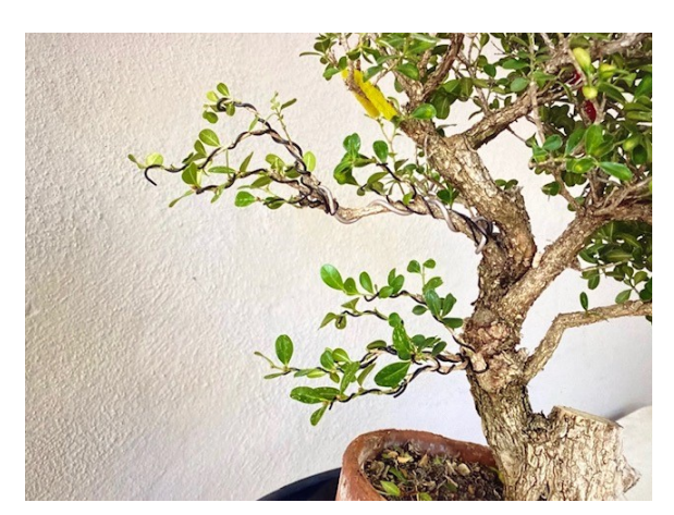
Expanded view showing branch pruning pattern.