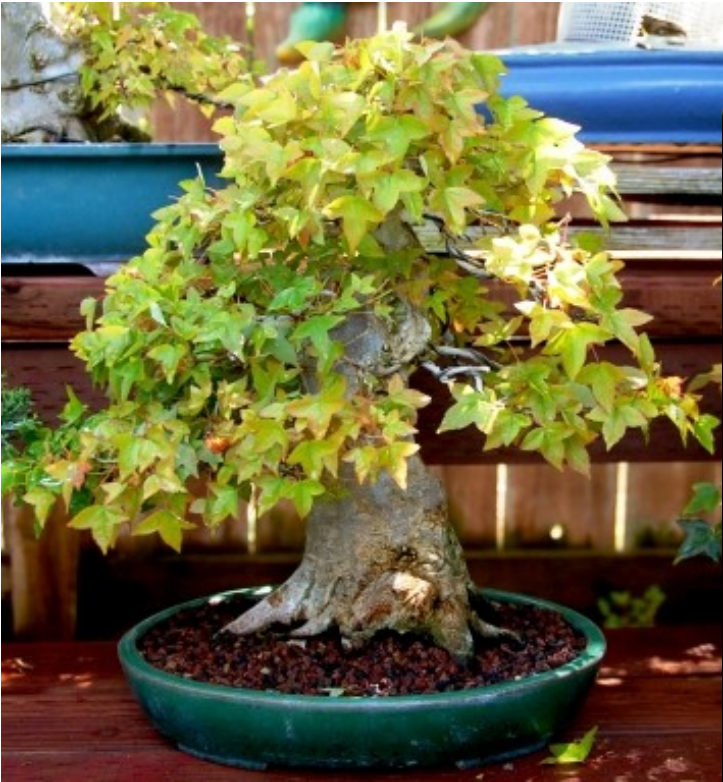
Above: one of Al Keplers many beautiful Trident maples.