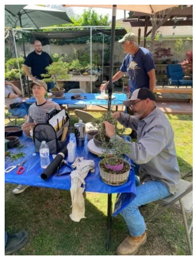
Working on trees at Cris Saldana's . No that isn't Cris kneeling in the middle of the group picture!