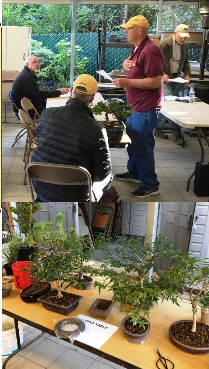
Images from the October meeting: raffle items above and kusamono and examples of pots on left.