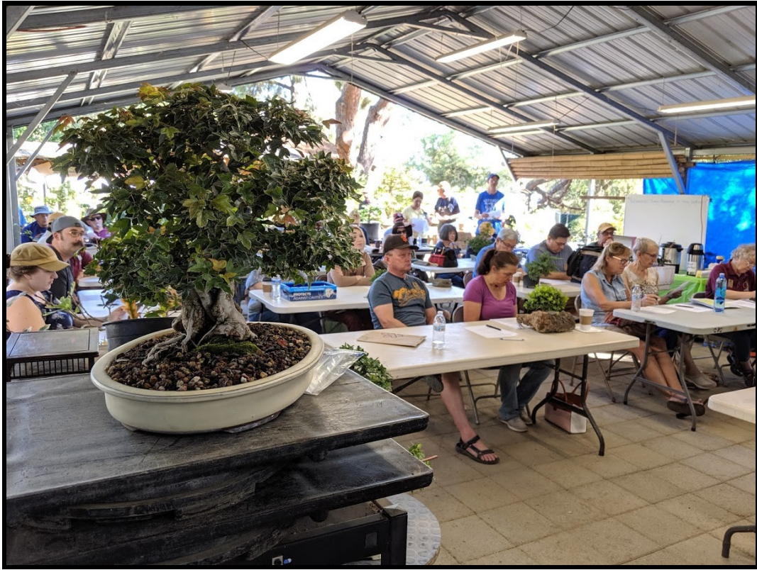
A great turnout for the September meeting.