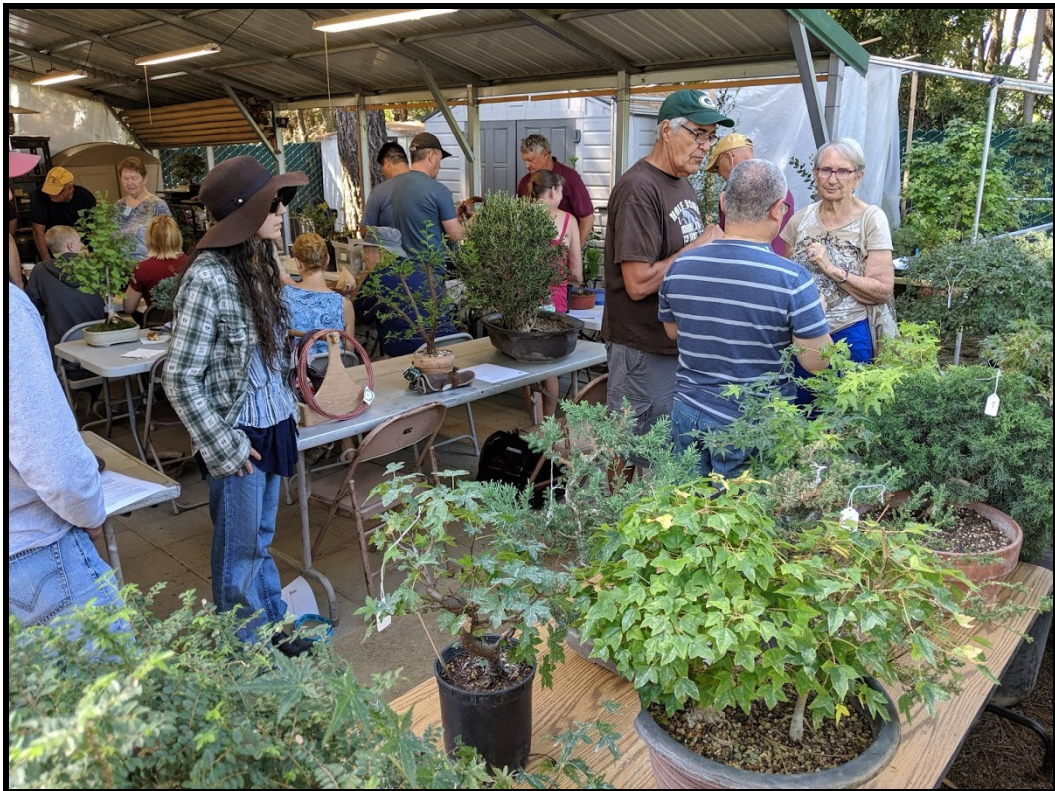
Trees for the FBS club raffle