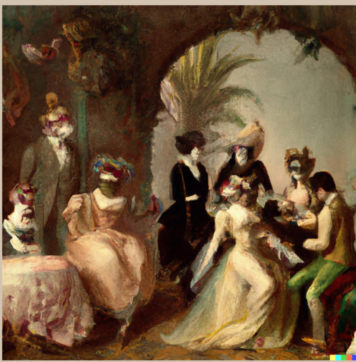
Image generated with the OpenAI Dalle-2 Art Generator with the text prompt: “Victorian-era painting of a masquerade ball with elaborate costumes, contrasting colors, and soft lighting, ultra detailed”

“There’s the issue of actually having deepfakes, where people really believe ... that a candidate is saying something when they’re totally a creation of AI.” Charles Schumer, U.S. Senator from New York.