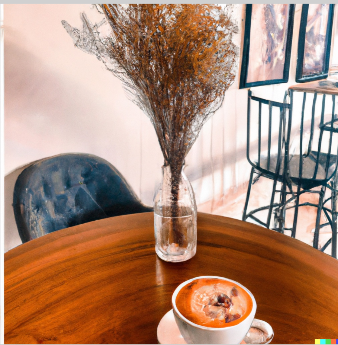
Image generated with the OpenAI Dalle-2 Art Generator with the text prompt: "Interior photography of a cozy corner in a coffee shop, using natural light, a pumpkin spice latte."

Welcome to October and Autumn 2023 and the return of pumpkin spice lattes. Here are the latest AI developments.