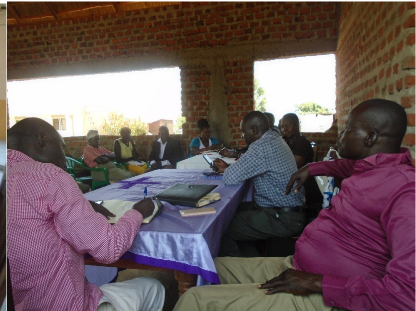
Children's home management committee