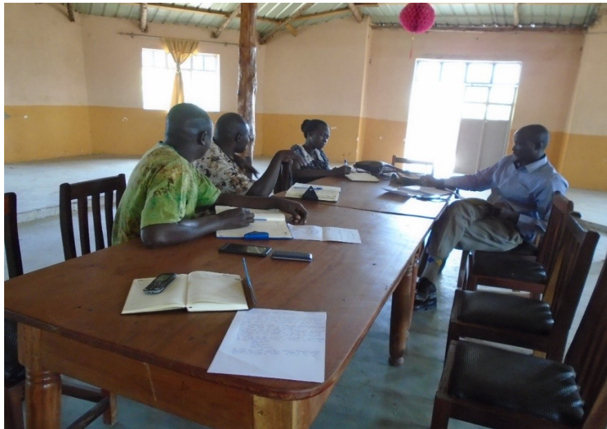
Formation of the children's home management committee meeting