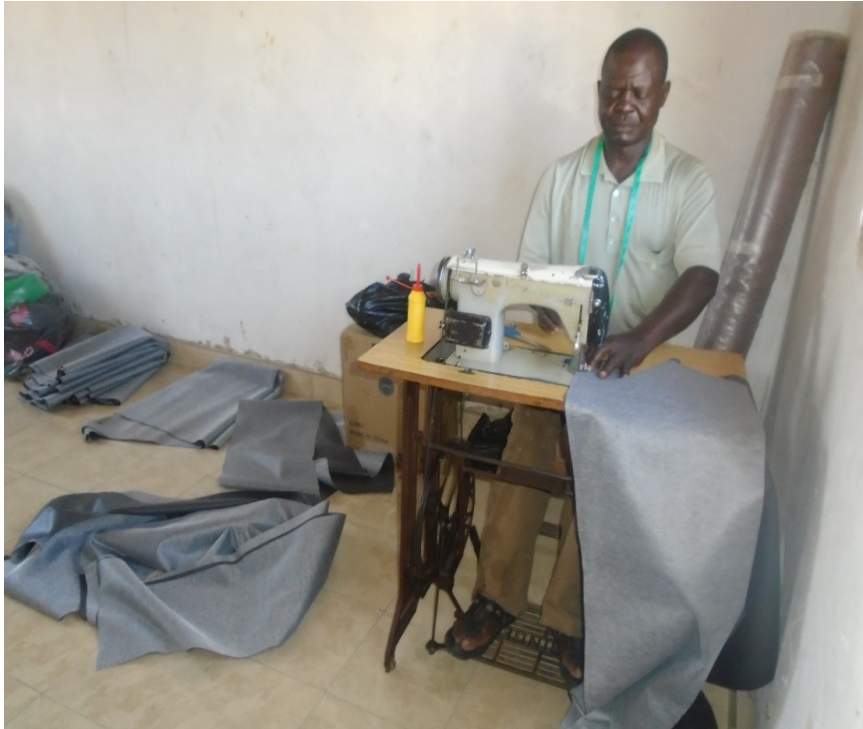
Sanitary towels/ always for the girls