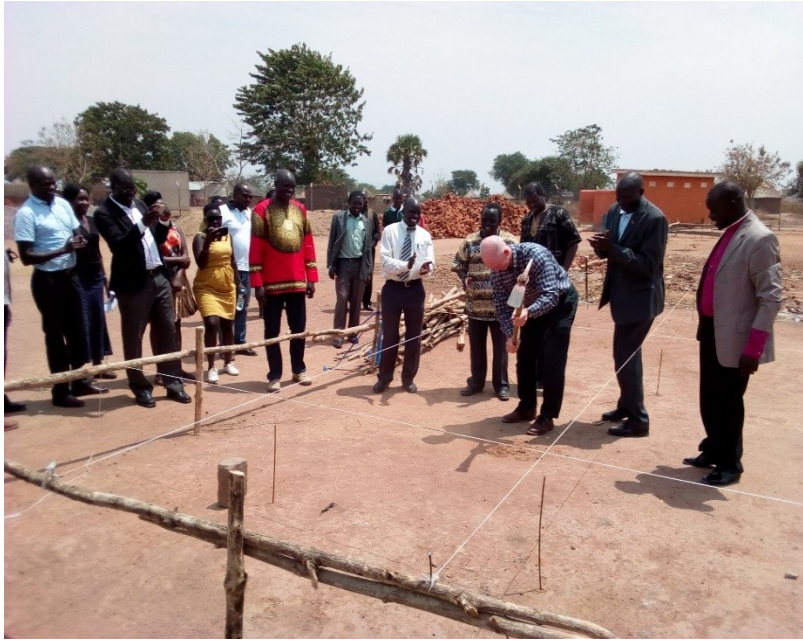
The septic tank