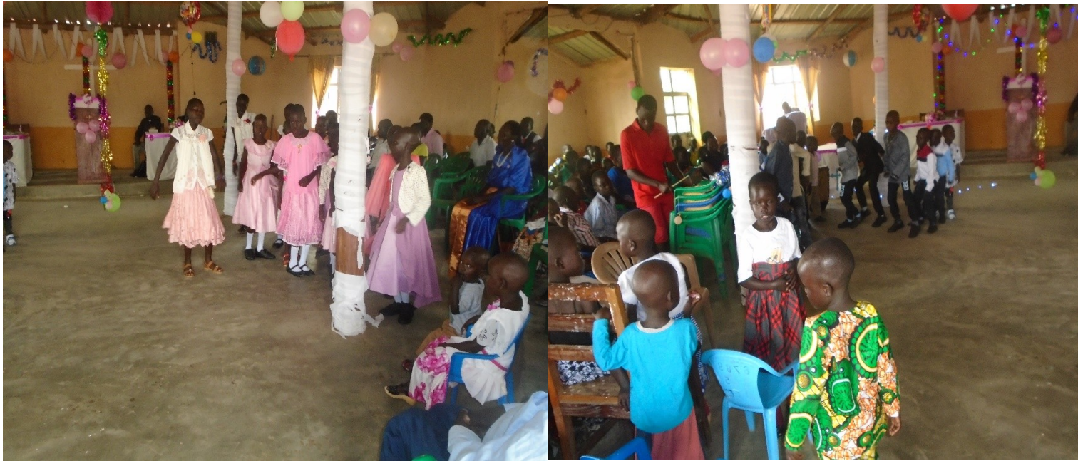
Christmas Food and drinks