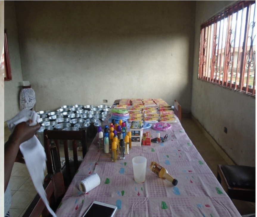
clothes for children