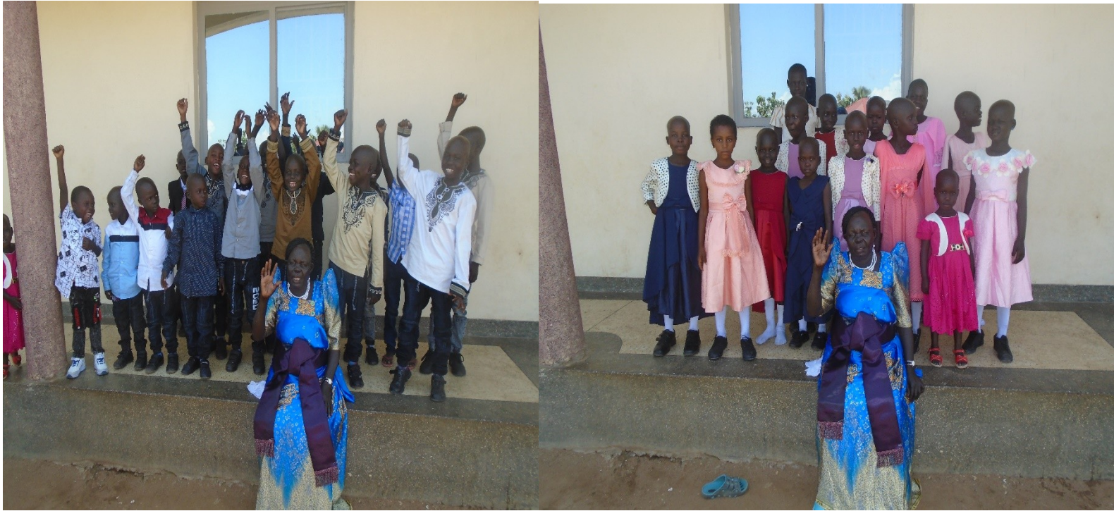
Christmas day church service- Sunday school kids during their presentation time.