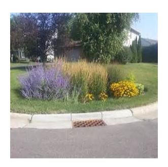
Rain gardens are beautiful as well as beneficial.

Have you ever wondered what to plant in that low spot in your backyard where the grass won't grow due to puddling from rain? Or how to fix the erosion gully where the rainwater drains away from one of your downspouts?