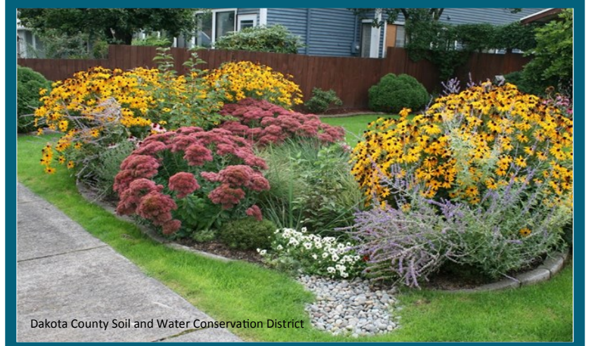
Dakota County Soil and Water Conservation District

The benefits include adding beauty to your yard, absorbing runoff which can reduce erosion and filter pollutants out of the water, provide habitat and food for pollinators and has potential reduce wet spots in your yard and therefore mosquito populations