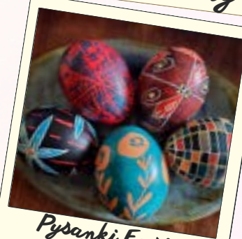
Pysanky Easter Eggs