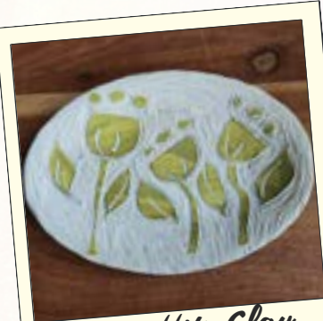
Sgraffito Clay Technique