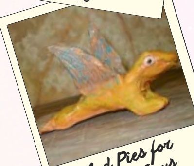
Mud Pies for Little Guys