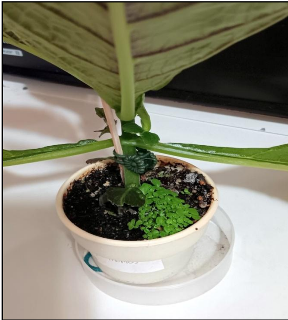
Barb's Chrysanthemum friedrichsthaliana with seedlings