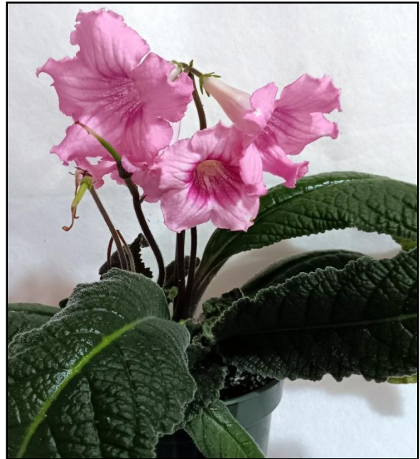
Barb's Streptocarpus seedling DS-2019 hybrid