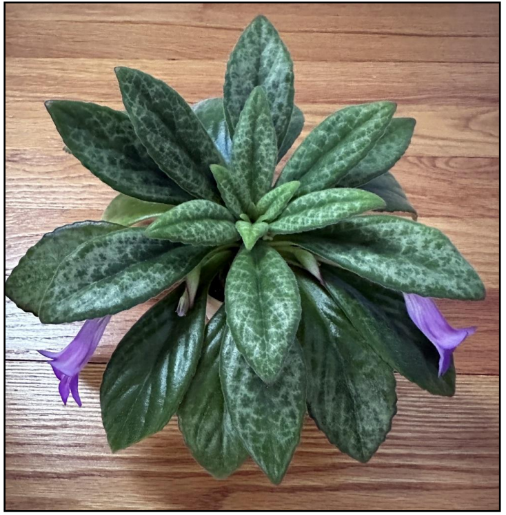
Dena's Primulina 'Silver Surfer'