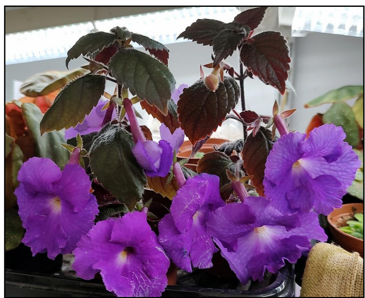
Dave's Achimenes 'Purple King'