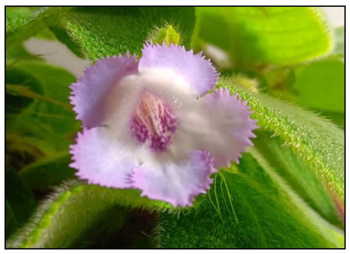
Barb's Episcia fimbriata "Blue Heaven'

https://www.amazon.com/dp/B09T3BZSL8?ref=ppx_yo2 ov_dt_b_product_details&th=1