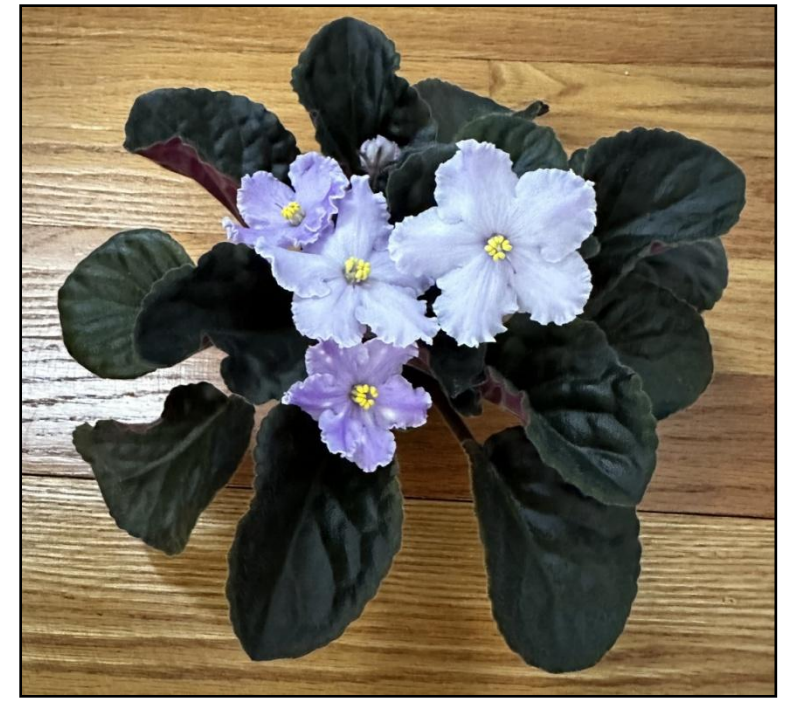
Volume 55 Number 5

Dena's Saintpaulia "Opera's Juliette'. "The blooms are covered with white fantasy puffs when they first open, & mature to a lovely pale lavender blue, which is a nice contrast against very dark foliage."