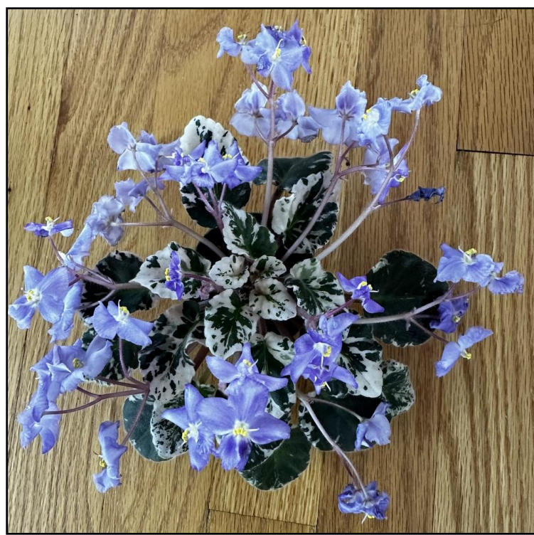
Dena's Saintpaulia 'Dean's Aquarius'