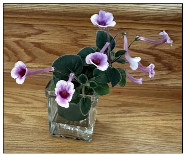
Dena's Sinningia 'Country Tiger'