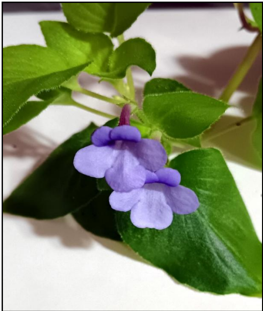
One of Barb's Microchiritas from 2024

October 4: Hi Barbara, A large pot is great . A shallow pot will be great. Usually when transplanting seedlings, I do not transplant them individually but in small clumps. It is easier to handle. A easier method will be to sow the seeds thinly in a large shallow pot. No transplanting needed. Cheers. Tuck Lock