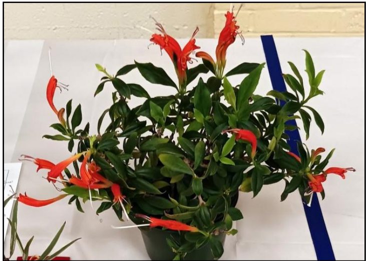
Jill Fischer's Aeschynanthus 'Mira'