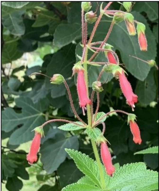
Close up of Towering Inferno flowers