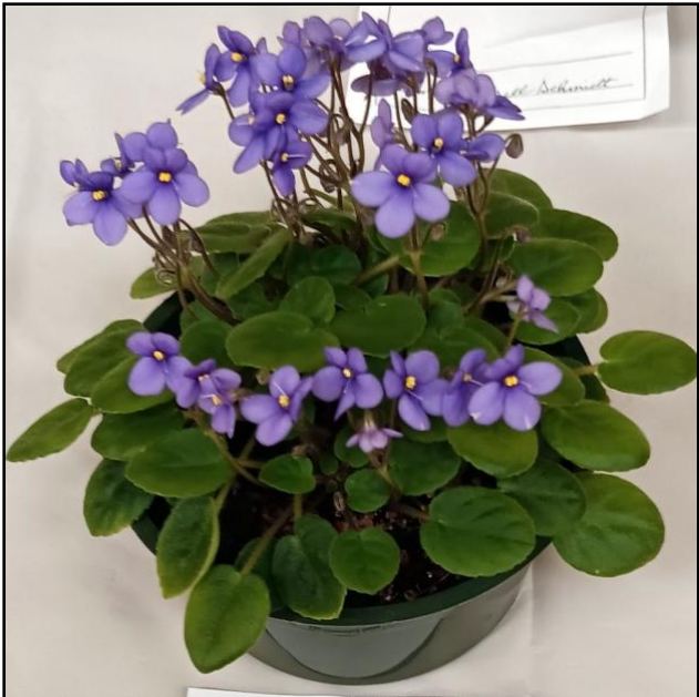
Minh's Saintpaulia 'Blue Boy'