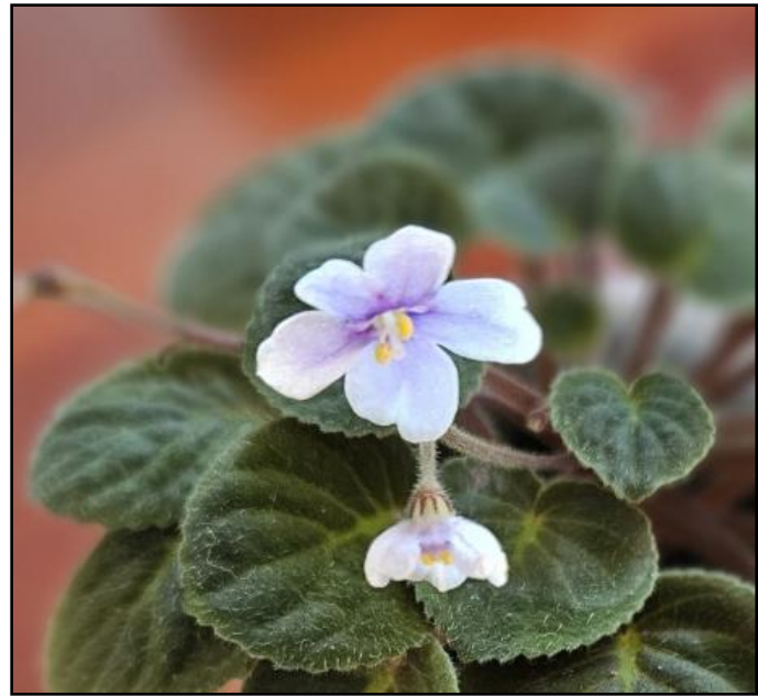
Close up of S. velutina