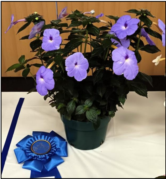
Barb Borleske Best Horticulture: Achimenes 'Blue Swan'