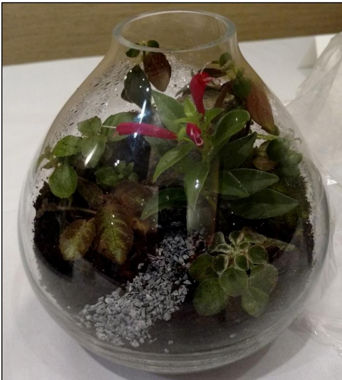
Barb's blue ribbon winner: 'Bottle Garden'