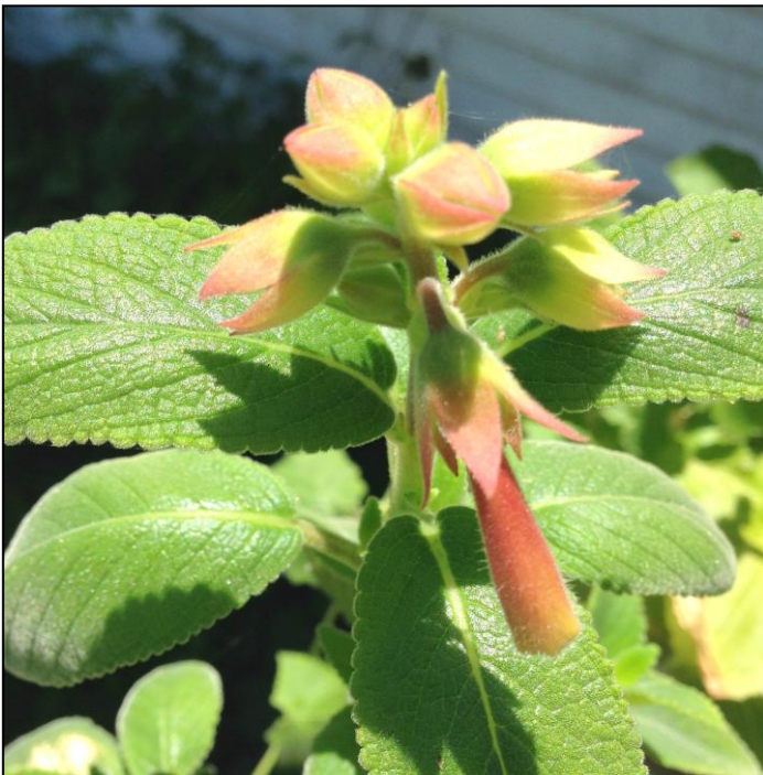
Donna's Sinningia vacariensis

At every meeting our members bring extra plants, cuttings, supplies donate them to the raffle table. Tickets for the raffle are only 3 for a dollar and everyone who attends the meeting gets one ticket just for showing up (including guests). Here's what you'll see on the table at a meeting: Gesneriad plants, rhizomes, tubers, cuttings, seeds, companion and/or garden plants, cuttings and gardening supplies.