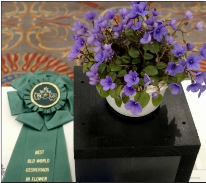
Bill Schmidt. First time at convention! Congratulations Bill! Saintpaulia 'Tiny Wood Trail'. Bill not only received a blue ribbon but also the award for the best Old World Gesneriad in bloom (beating out all the other spectacular old world plants such as the Streptocarpus ).