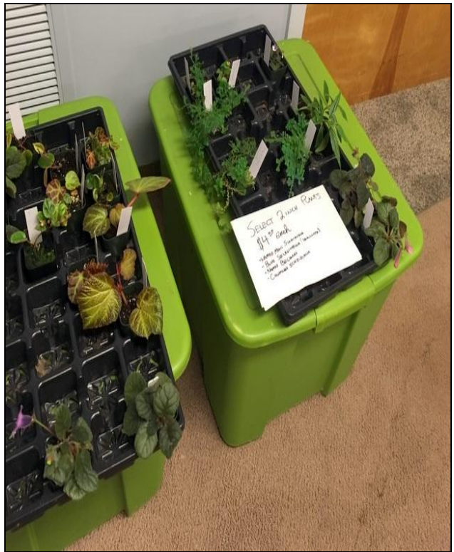
Our first meeting with plants for sale . Members enjoyed buying Dave's plants at $4.00 with our group receiving 25%.