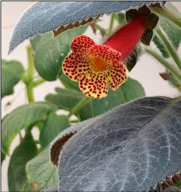
Donna's Kohleria 'Silver Feather'