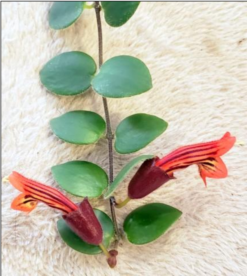
Barb Stewart's Aeschynanthus 'Thai Red'