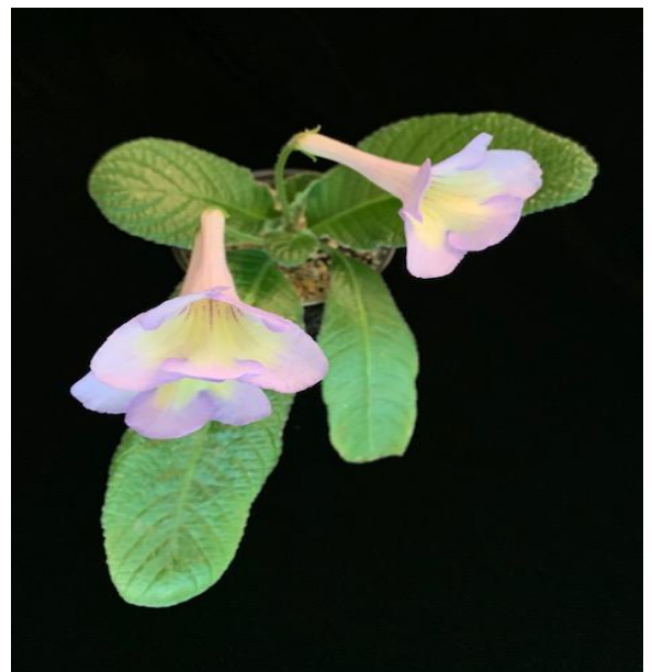
Doug Bolt's Streptocarpus 'Blue Halo'