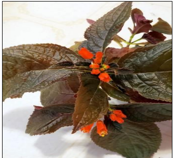
Barb's Chrysothemis 'Black Flamingo'