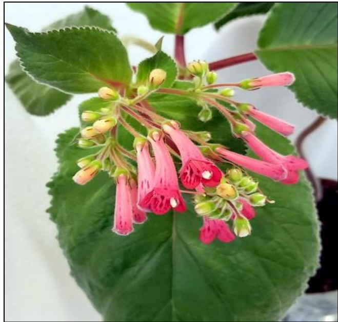
Barb Stewart's Sinningia ramboi in all its stages of growth. So beautiful !