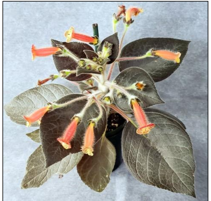
Barb Stewart's Kohleria 'El Capital' close up and a view of the plant from above.