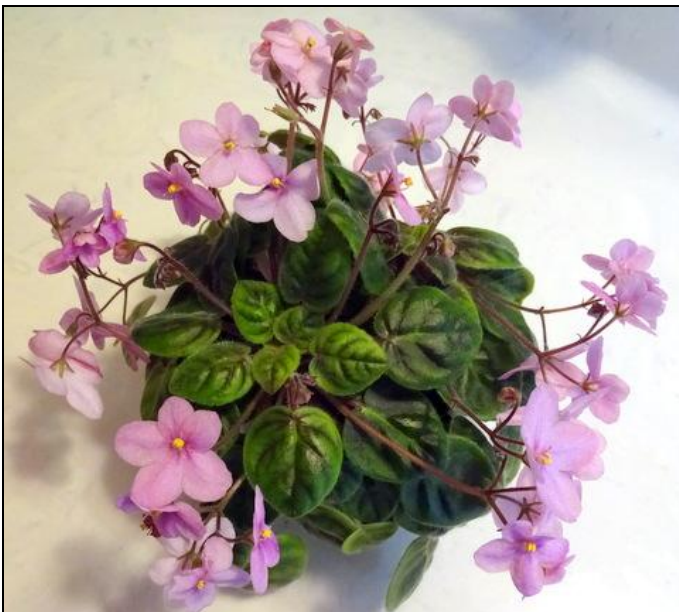
Bill's Saintpaulia 'Foxwood Trails'