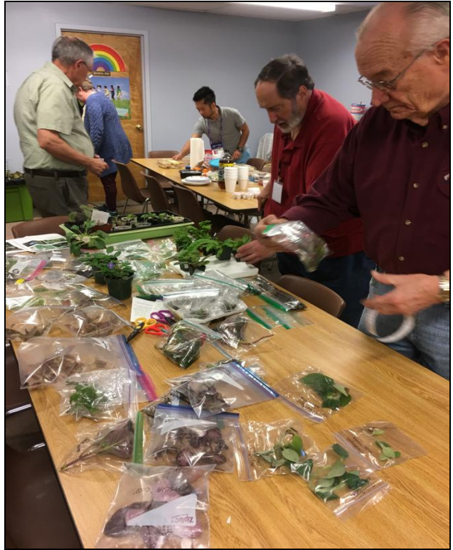
Raffle table full of goodies!