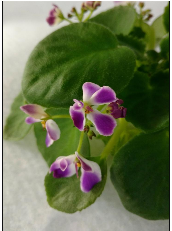
Barb's Saintpaulia 'Kentucky Red Devil'