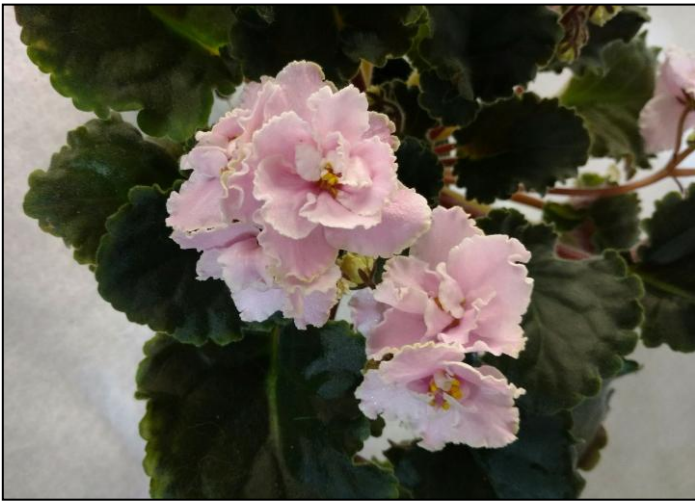
Barb's Saintpaulia 'Tiffany'