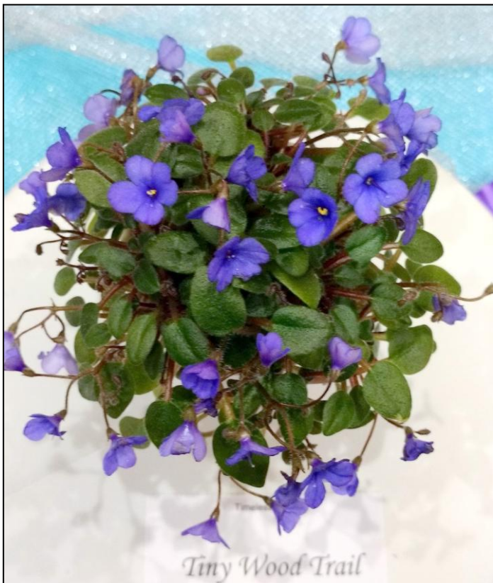
Kitty's Saintpaulia 'Tiny Wood Trail': Third Best in Show at MAAVS