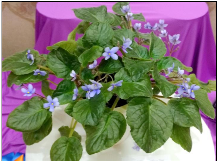
Kitty's Saintpaulia orbitularis : Best in Show at MAAVS and Bloomin' Now