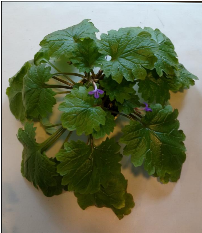
Barb's Primulina tobacum