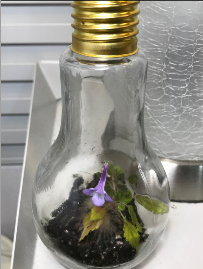
This is an interesting gift terrarium container, blooming on my desk at work.

We've all seen terrariums in Garden Centers and at flower shows. The beauty of a well built terrarium is that it can last just about forever with almost no care. I've got a begonia in a glass container at home that only gets opened when I need to take a cutting to share. I think it's been watered twice in ten years. It's still growing in its original soil mix!