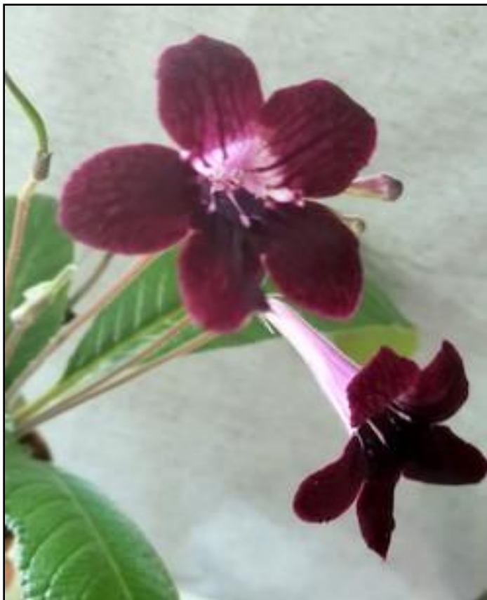
Barb's Streptocarpus seedling