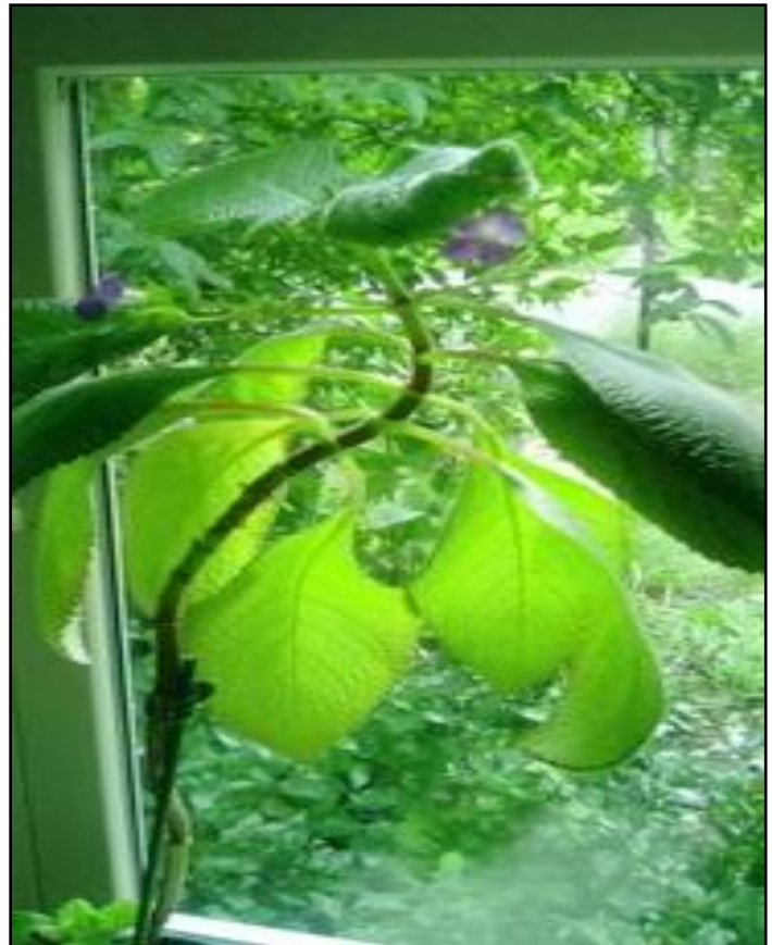
Bill's Nautilocalyx 'Burle Marx'