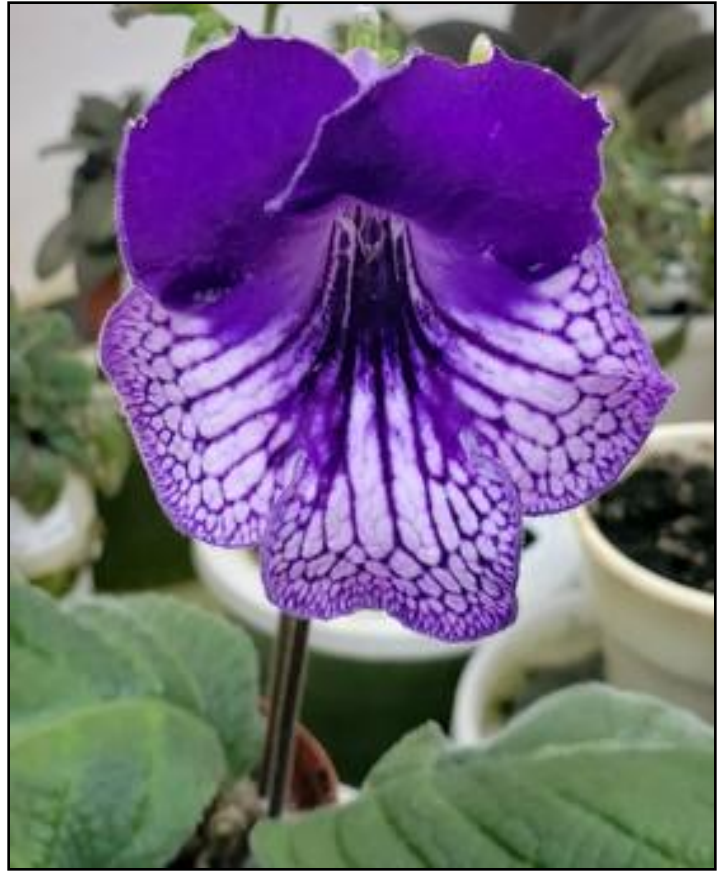
Barb's Streptocarpus 'Midnight Poison 2'