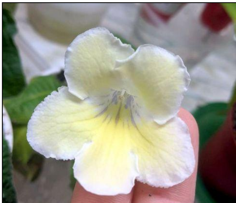
Nadya's latest hybridized beauty... a gorgeous yellow Streptocarpus! Congrats!