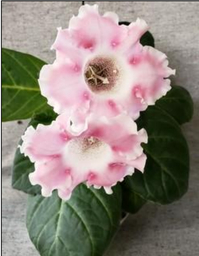
Barb's Sinningia speciosa unnamed Regina hybrid x burgundy double seedling (NOID)