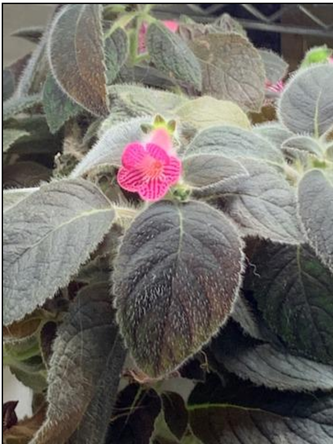
Donna's Kohleria 'Peridots Rolo' still blooming