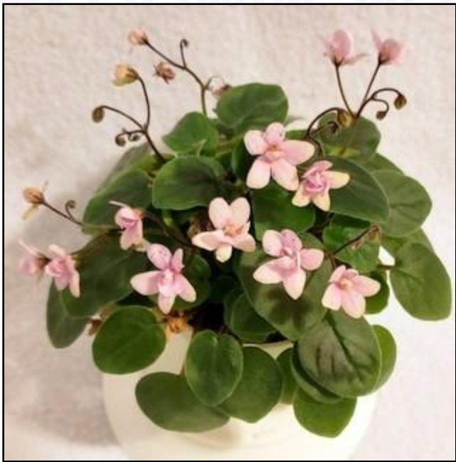
Barb's Saintpaulia 'Rob's Boolaroo'