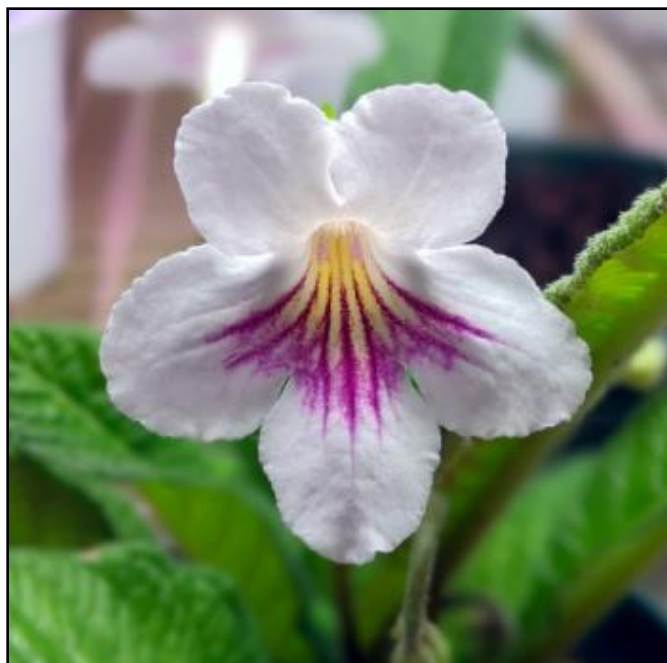
Kitty's Streptocarpus 'Myfanwy' "I love this little plant. The blossoms are simple, but plenty. And unlike 'Roulette Cherry', it is quite compact. The longest leaf on my plant is only 7.5 inches from soil to tip."