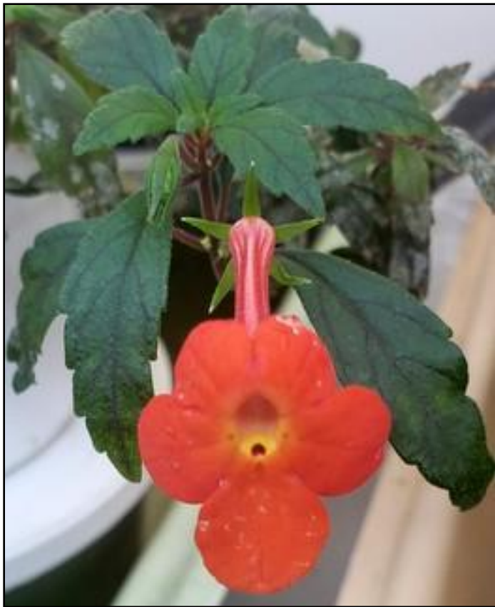
Barb's Achimenes admirabilis