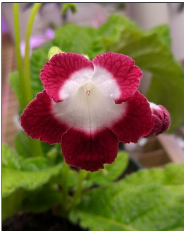
Kitty's: ' Streptocarpus 'Roulette Cherry' ... one of my favorites. Its only drawback is that it can become a huge monster if you don't keep the foliage in check."