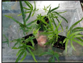
Begonia eleagnifolia , Nematanthus 'Cheerio', Pteris cretica (fern)