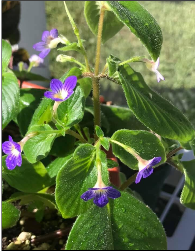
Jim Robert's Microchirita (Phuket species) growing in Florida