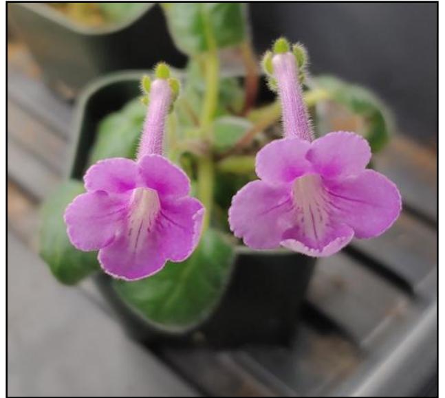
Dave's Sinningia 'Mini Lavender'