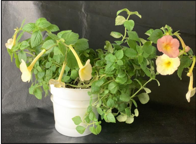
Donna's surprise: Achimenes bi-color NOID