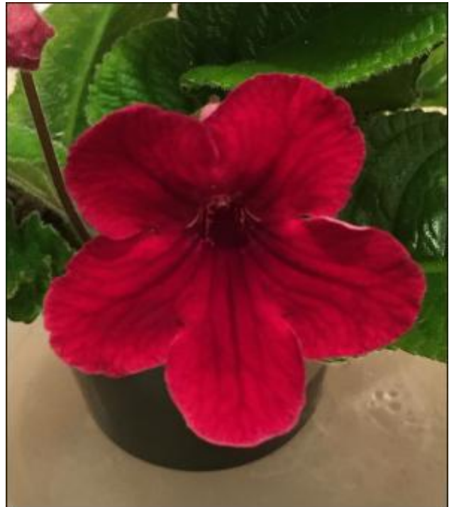
Streptocarpus Ladyslippers Scarlet