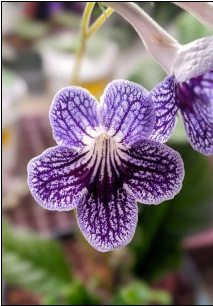
Kitty's Streptocarpus 'Somerset Indigo Ice'