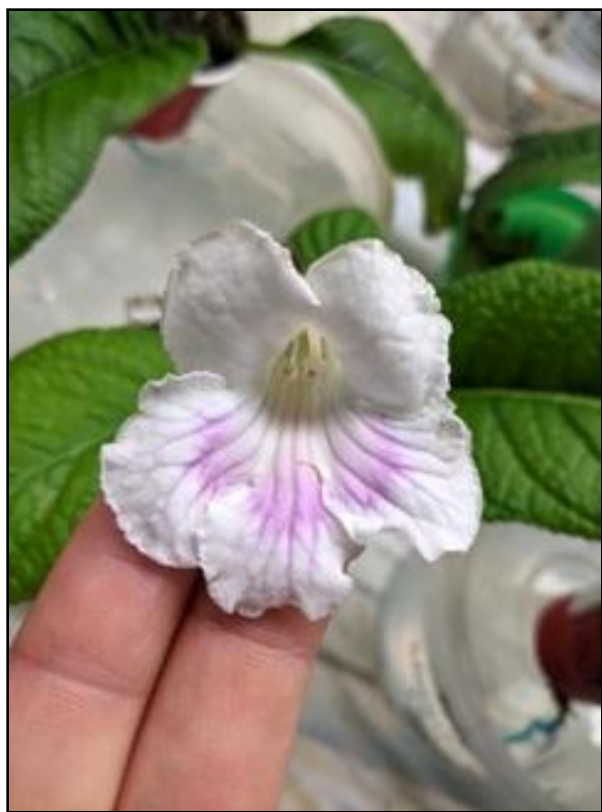
Nadya's Streptocarpus seedling she hybridized!