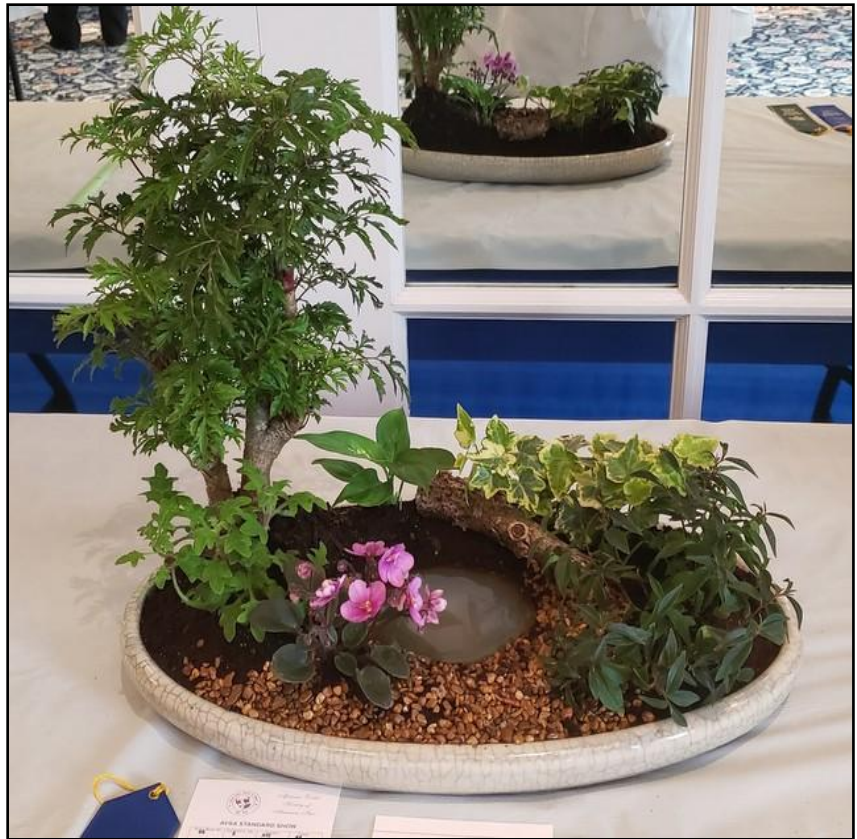
Nadya's Streptocarpus hybrid in RAVS