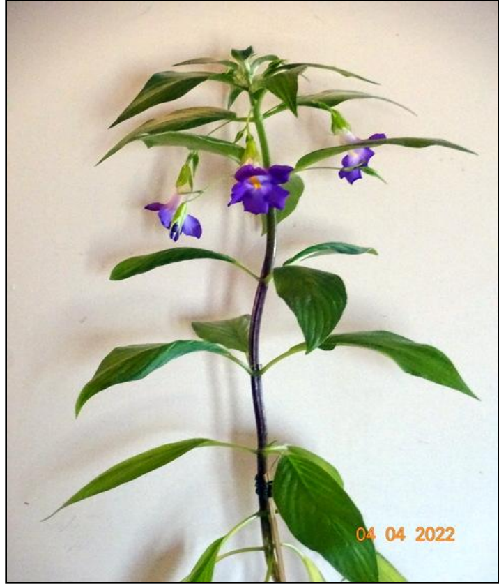
Bill's Henckelia moonii