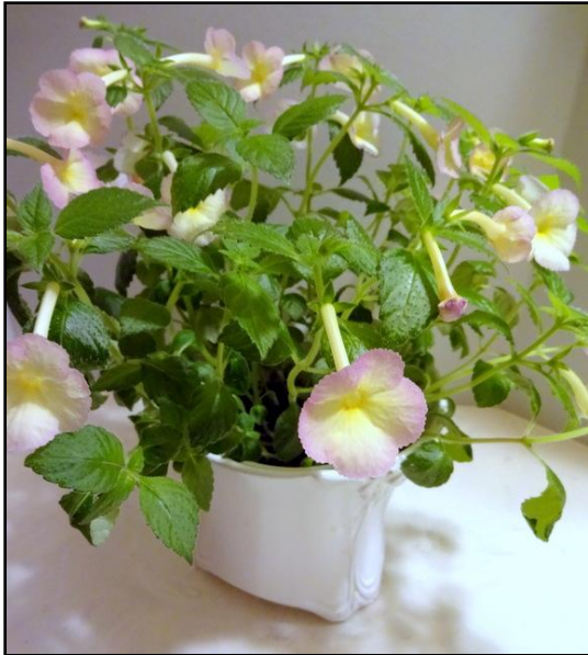
Bill's Achimenes 'Sauline'