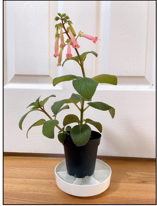
Dena's Sinningia grown from mixed seed packet when joining AGS several years ago.