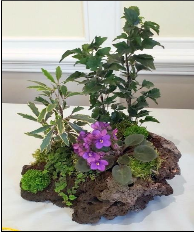
Barb S: Best Design in show