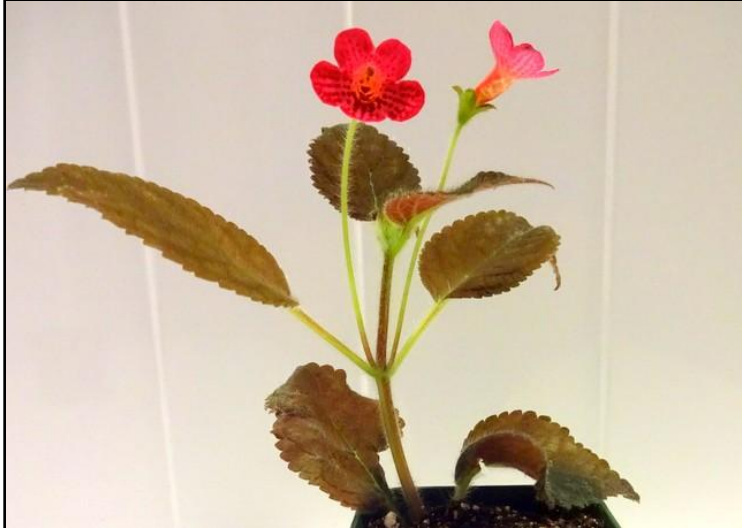
Bill's Kohleria 'Little Flirt'