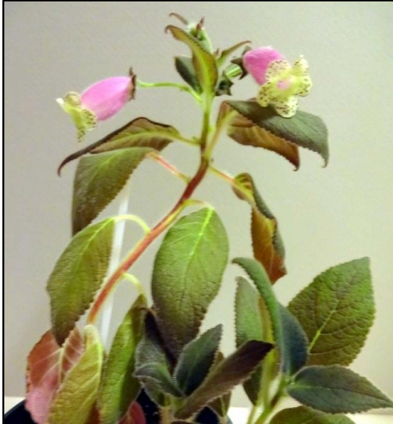
Bill's Kohleria 'Beltane'