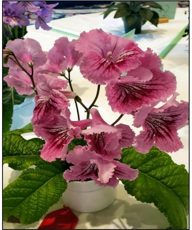
Barb Koski's Streptocarpus hybrid