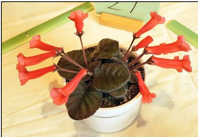
Kitty's Sinningia 'California Sunset'