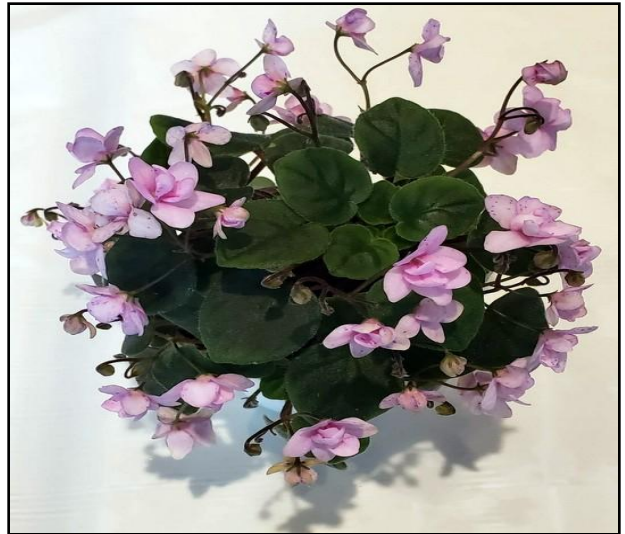
Bill Schmidt's Saintpaulia 'Rob's Boolaloo'