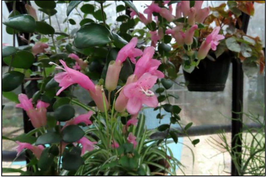
Johanna's Aeschynanthus 'Thai Pink' a non stop bloomer