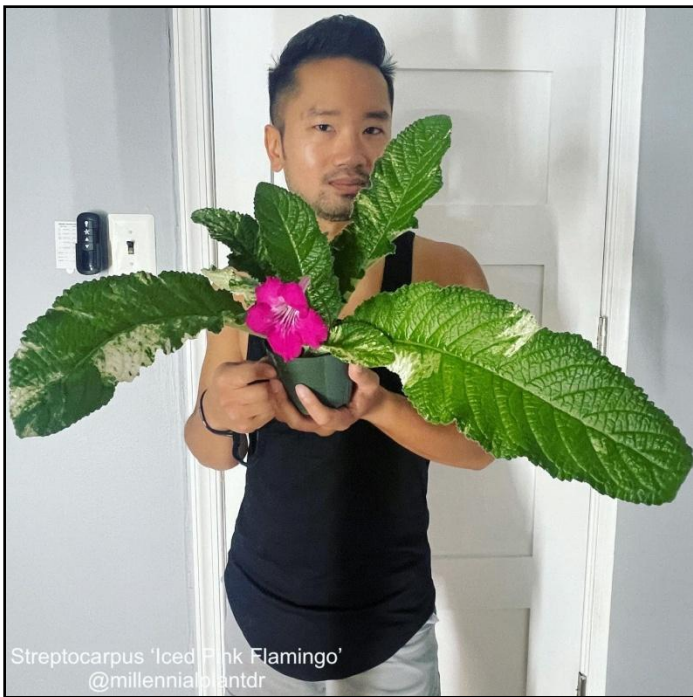
Streptocarpus 'Iced Pink Flamingo' @millennialplantdr