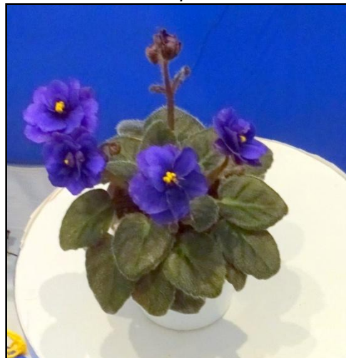
Bill's Best Miniature Saintpaulia 'Rob's Voodoo Blue'