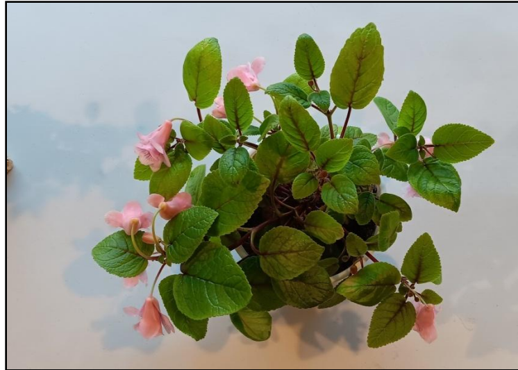
Kitty's Sinningia 'Thad's Party Dress'