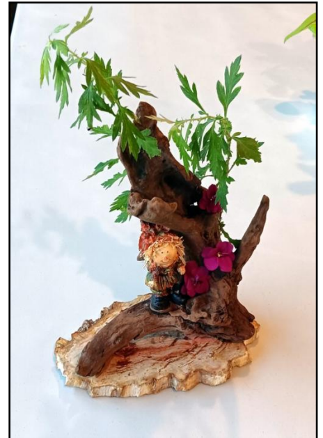
Barb S. Autumn display