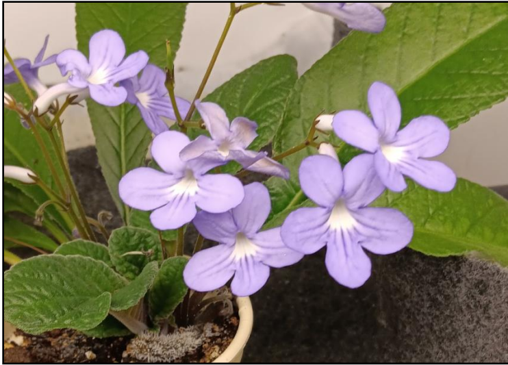
Barb S. Streptocarpus seedling 'Blue Stars'