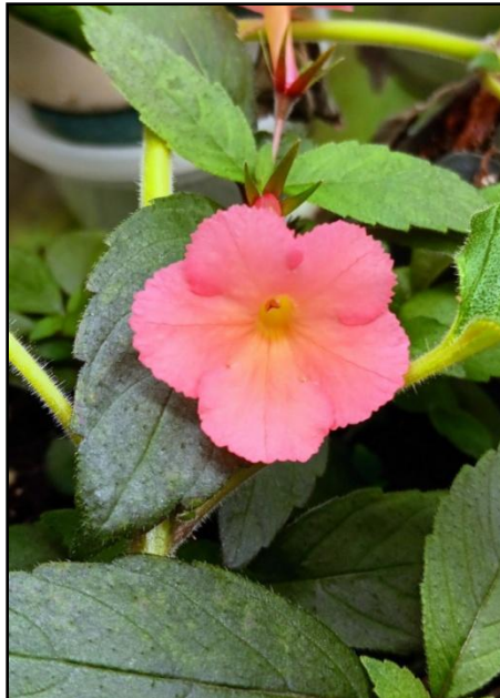
Barb S. Achimenes 'Peach Glow'