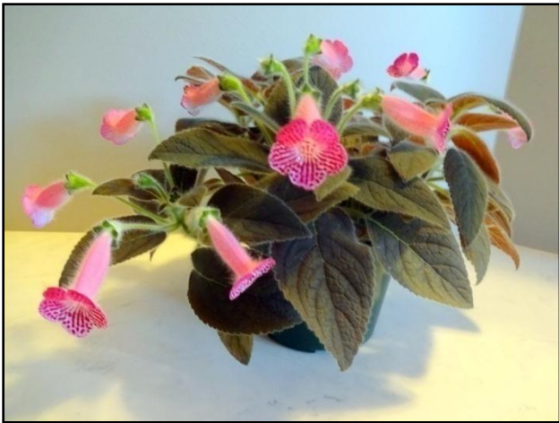
Bill's Kohleria 'Peridots Rolo'