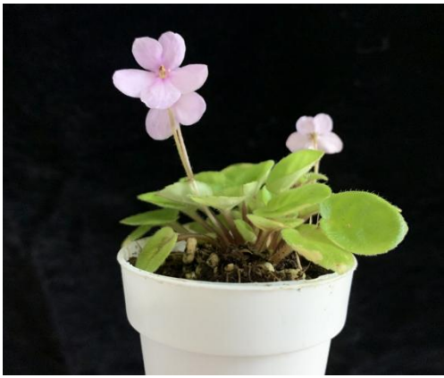
S. 'Pixie Pink'