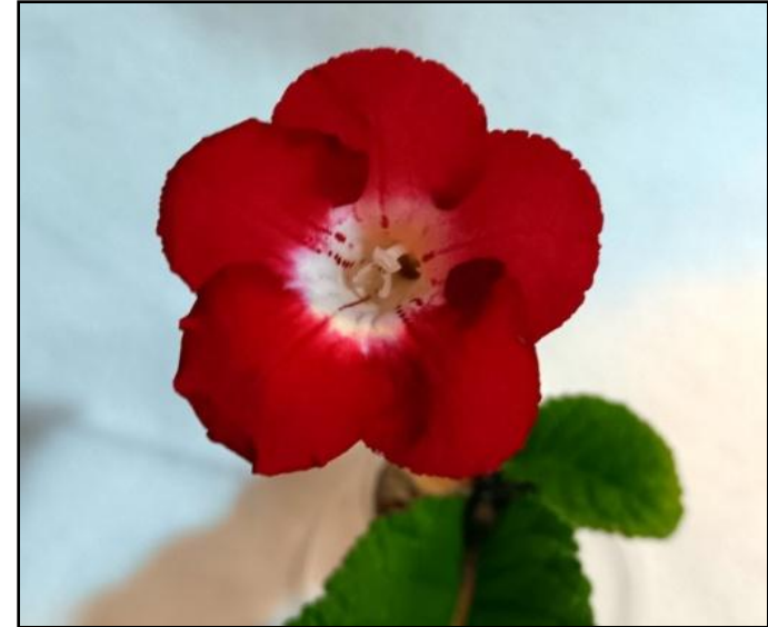
Barb's Streptocarpus 'Big Red' from January raffle.