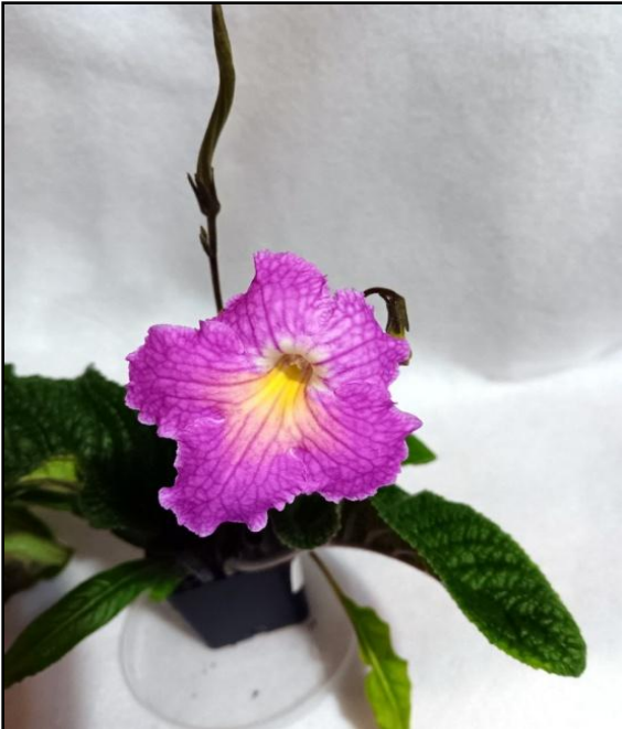
Barb S: Streptocarpus 'OD Igra Voobrazheniya' x other hybrid seedlings with seed pod