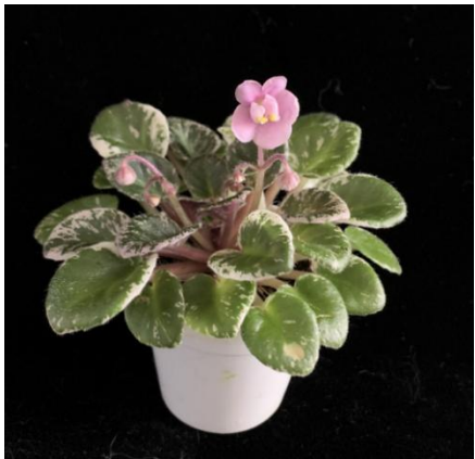
S. 'Pink Dove'