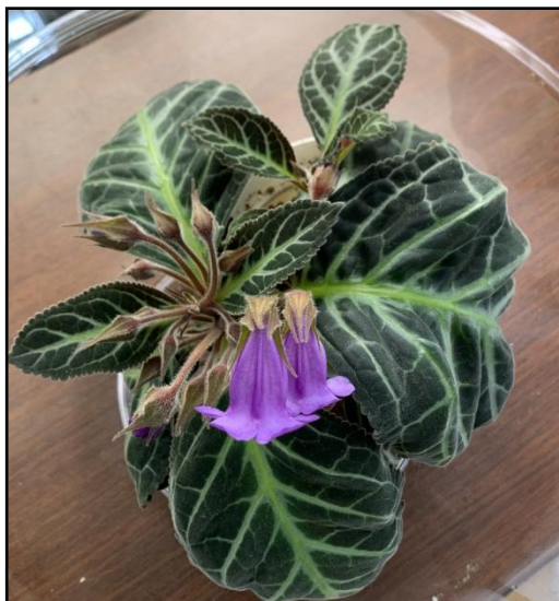
Donna's Sinningia speciosa 'Regina' 'Serra Da Vista' seedling that is at least 3 years old. Second photo is top of plant. "I moved it from plant shelf in the open to a large terrarium made from 2 salad bowls and the leaves are uncurling somewhat. I think it needs more humidity. I just set up small humidifier in the living room for my sinningias"