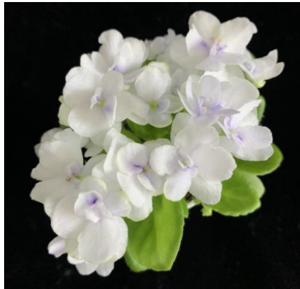
S. 'Jolly Orchard'