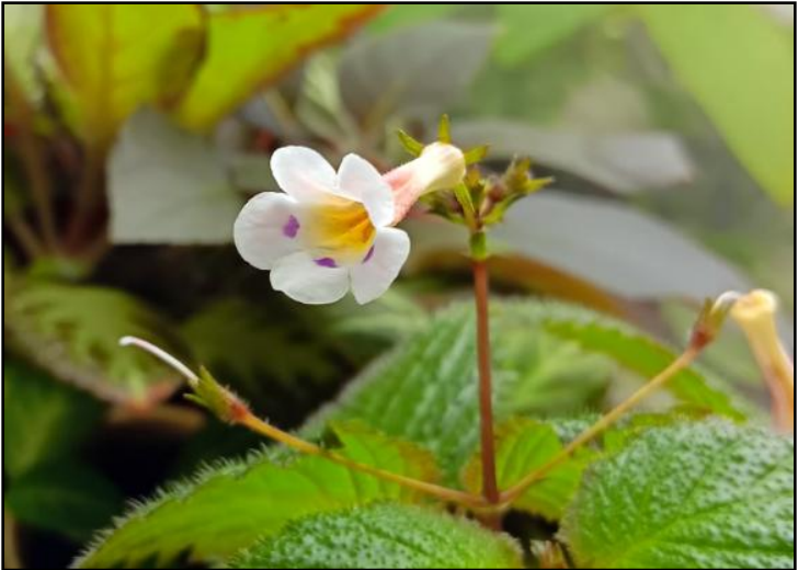
Barb's Diastema racemiferum