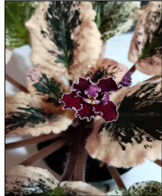
Barb's Saintpaulia 'Sleigh Bells'