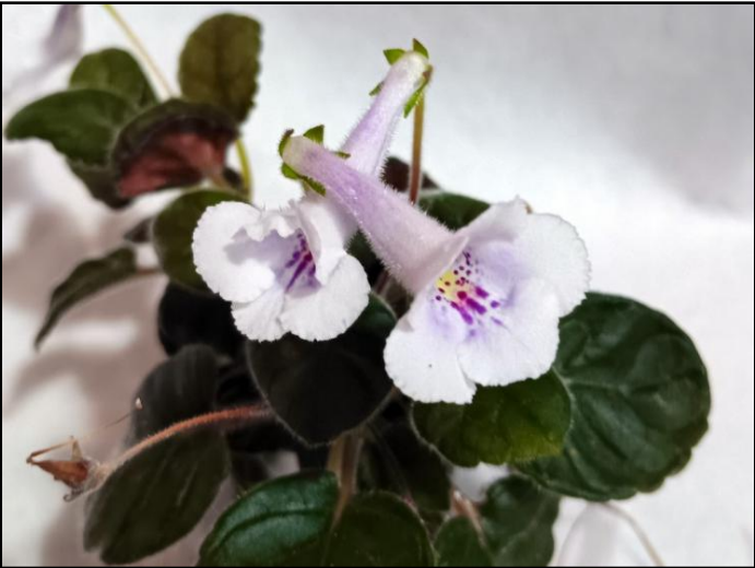
Barb S's Miniature NOID Sinningia seedling