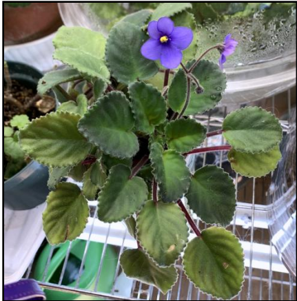
Donna's Saintpaulia NOID (rupicola?)