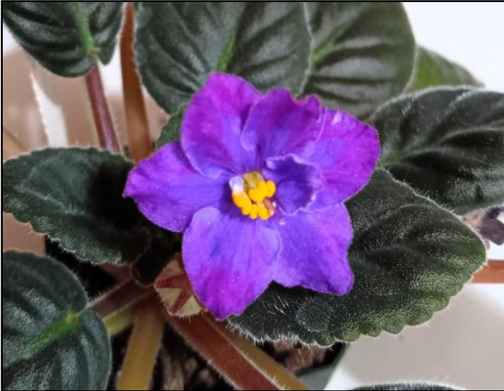
Barb's Saintpaulia 'Festival Amethyst'