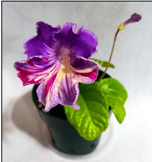
Kitty's Streptocarpus 'DS Little Parrot'