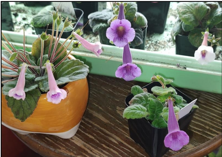
Dave's miniature Sinningia seedlings unnamed