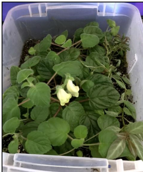
Donna's Sinningia conspicua seedlings, stage 2 prop' box. It is fragrant!