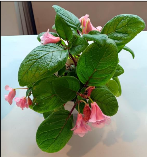
Bill's Sinningia 'Party Dress'