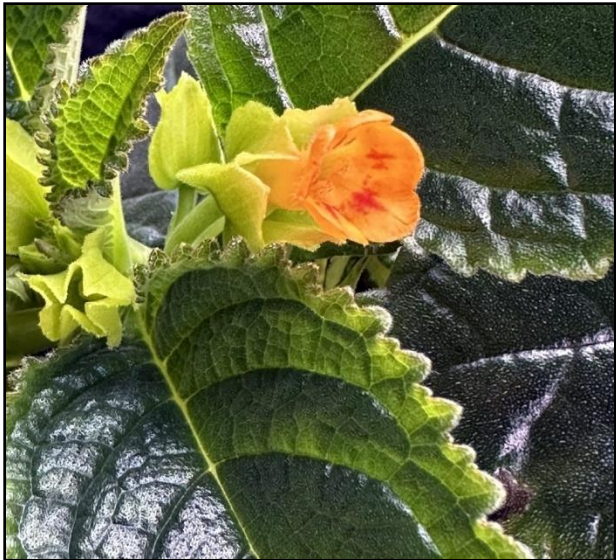
David's Chrysothemis friedrichsthaliana has green calyx.

"One of several Nematanthus species with flowers dangling well below spreading branches, N. fritschii is one of the parents of the excellent hybrid N. 'Stoplight' . Other Nematanthus with a similar dangling flower habit include N. crassifolius , N. corticola and N. brasiliensis "